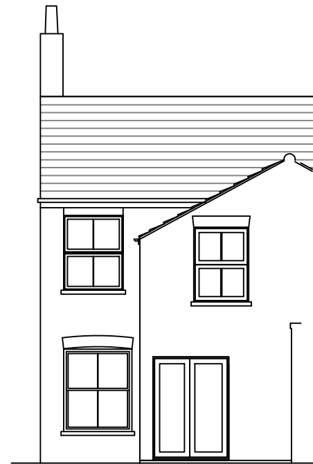
REAR ELEVATION EXISTING

Notes: All dimensions to be checked on site