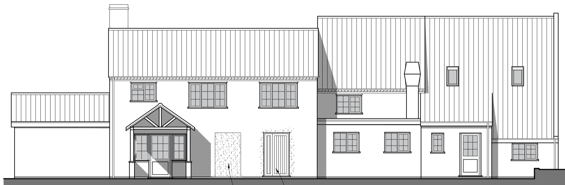
NORTHEASTERN REAR ELEVATIONS SCALE 1:100

Infill existing door and render to match existing New Timber framed door