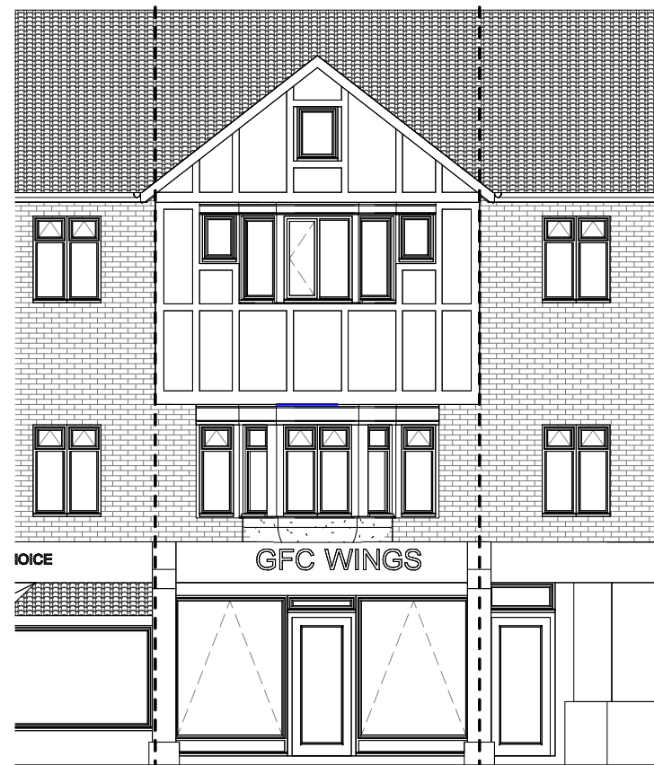
Existing Front Elevation 1 : 100