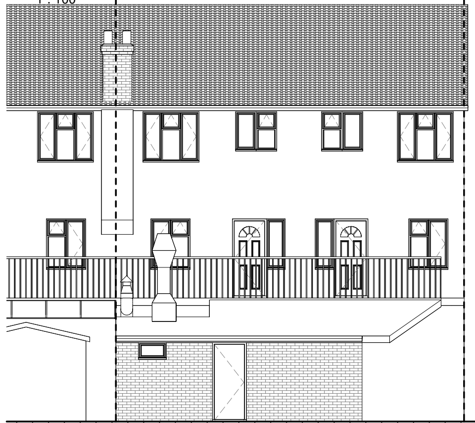
Existing Rear Elevation 1 : 100