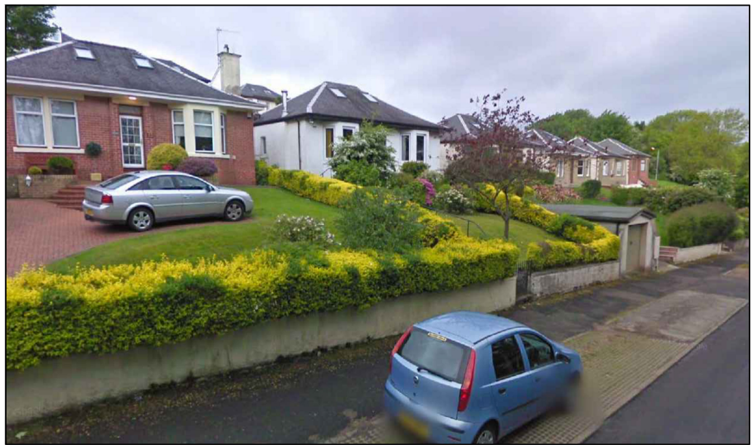
STREET VIEW NO. 3

Areas shown hatched on the adjacent Block Plan indicate areas of excavation for front Garden, existing access steps & side path, existing garden walling to Drumshantie Road and associated Garage to be removed. Downtakings will adhere to BS6187:2011.