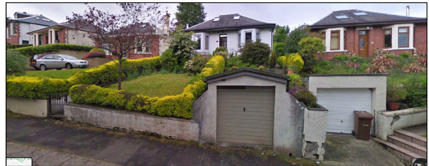
STREET VIEW NO. 2