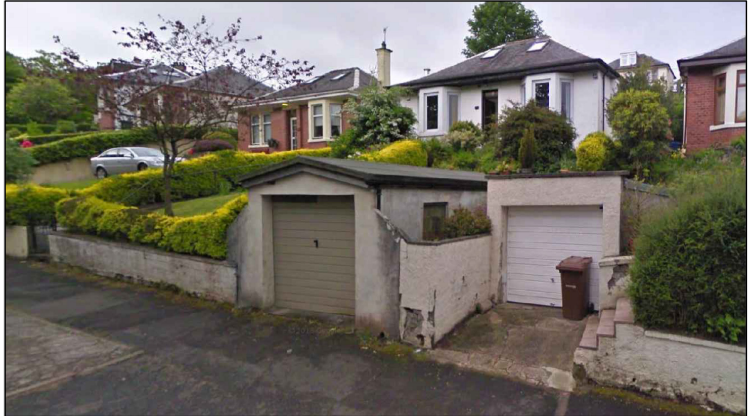
STREET VIEW NO. 1