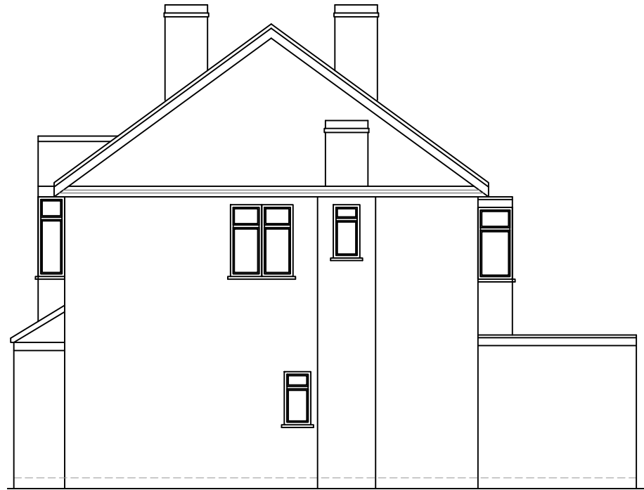
EXISTING ELEVATION SIDE A SCALE 1:100