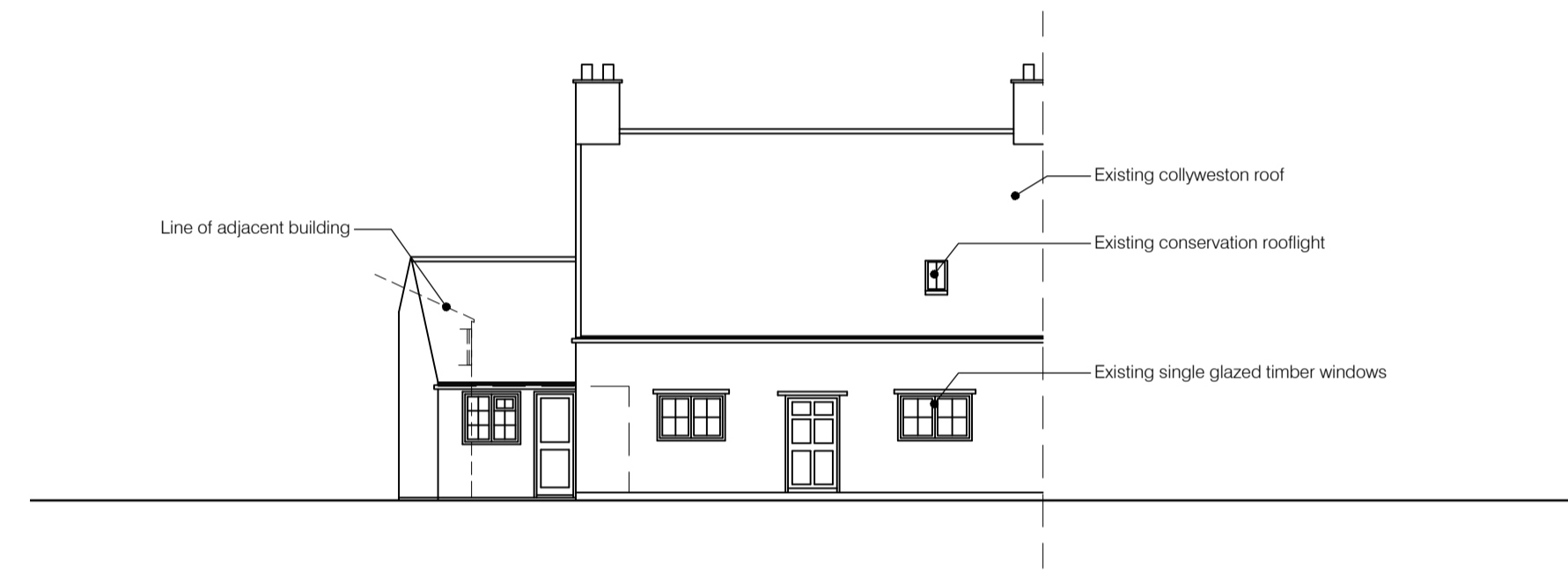
3 SOUTH WEST ELEVATION EXISTING A-300 SCALE 1:100 @A1