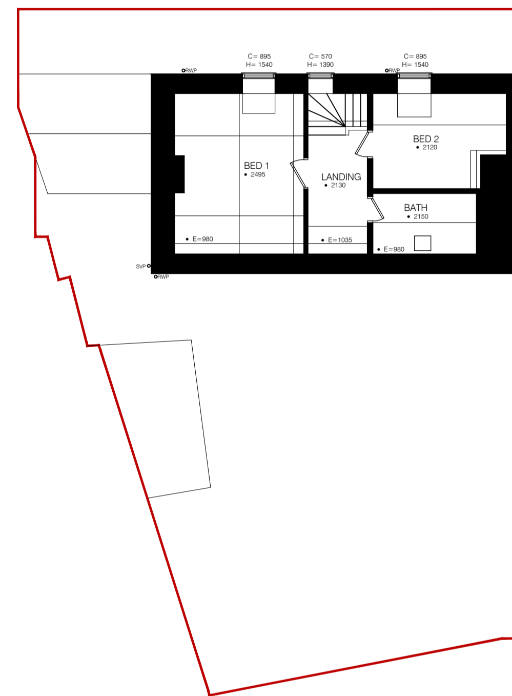
2 FIRST FLOOR PLAN A-101 SCALE 1:100 @A1