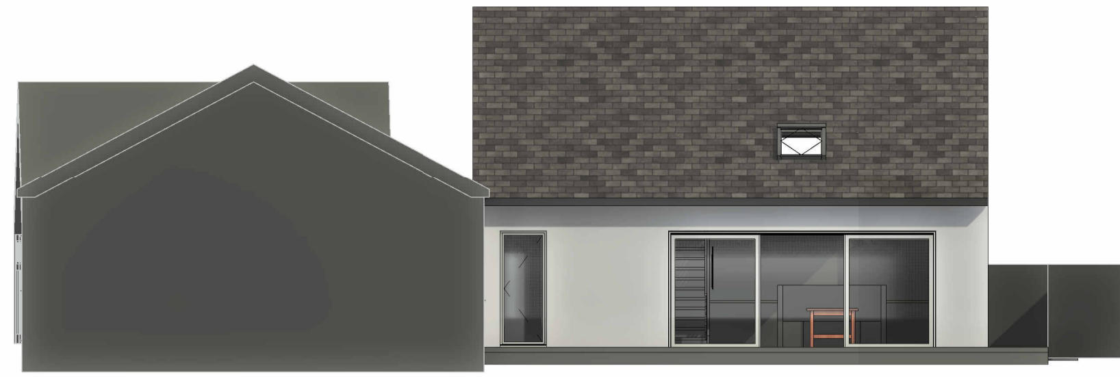
North 1 : 100