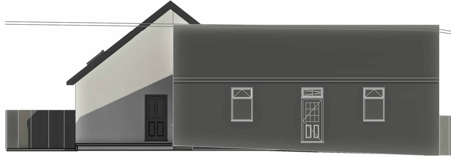
East Sectional Elevation 1 : 100