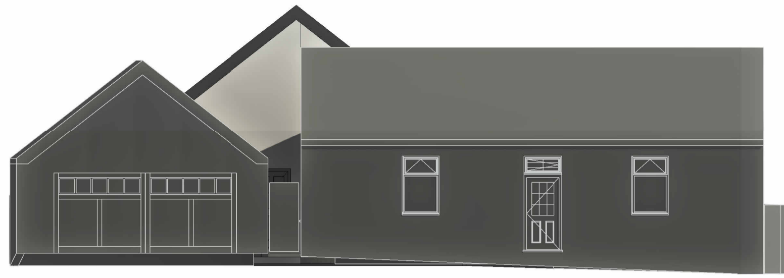
East 1 : 100