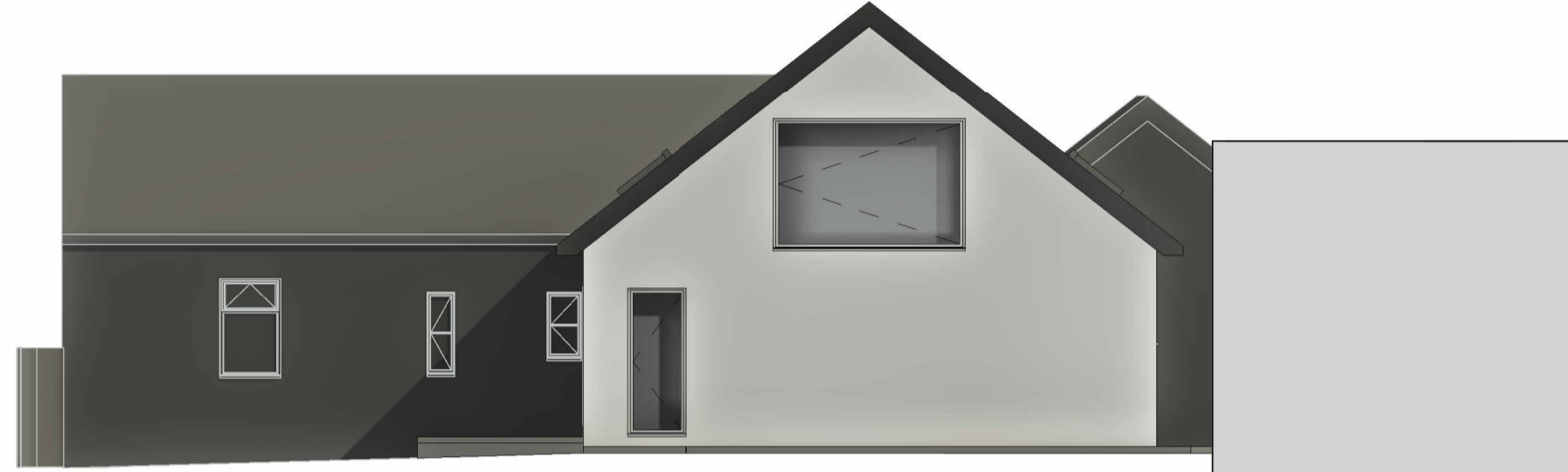
West 1 : 100