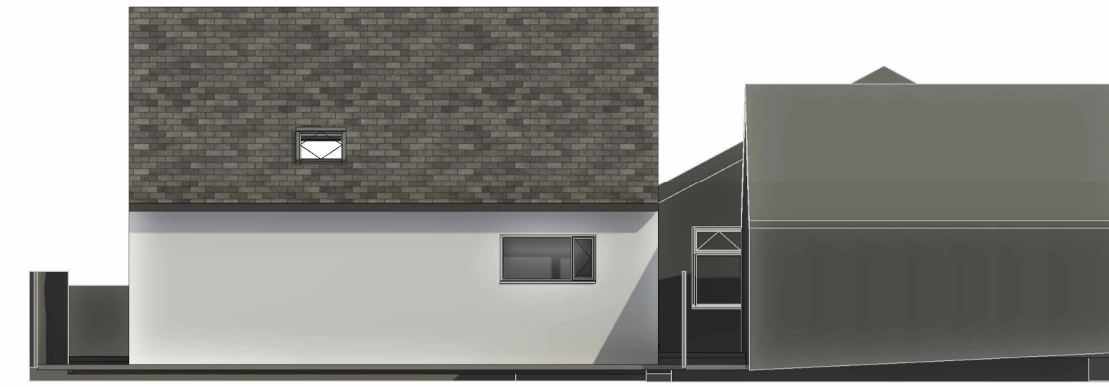
South 1 : 100