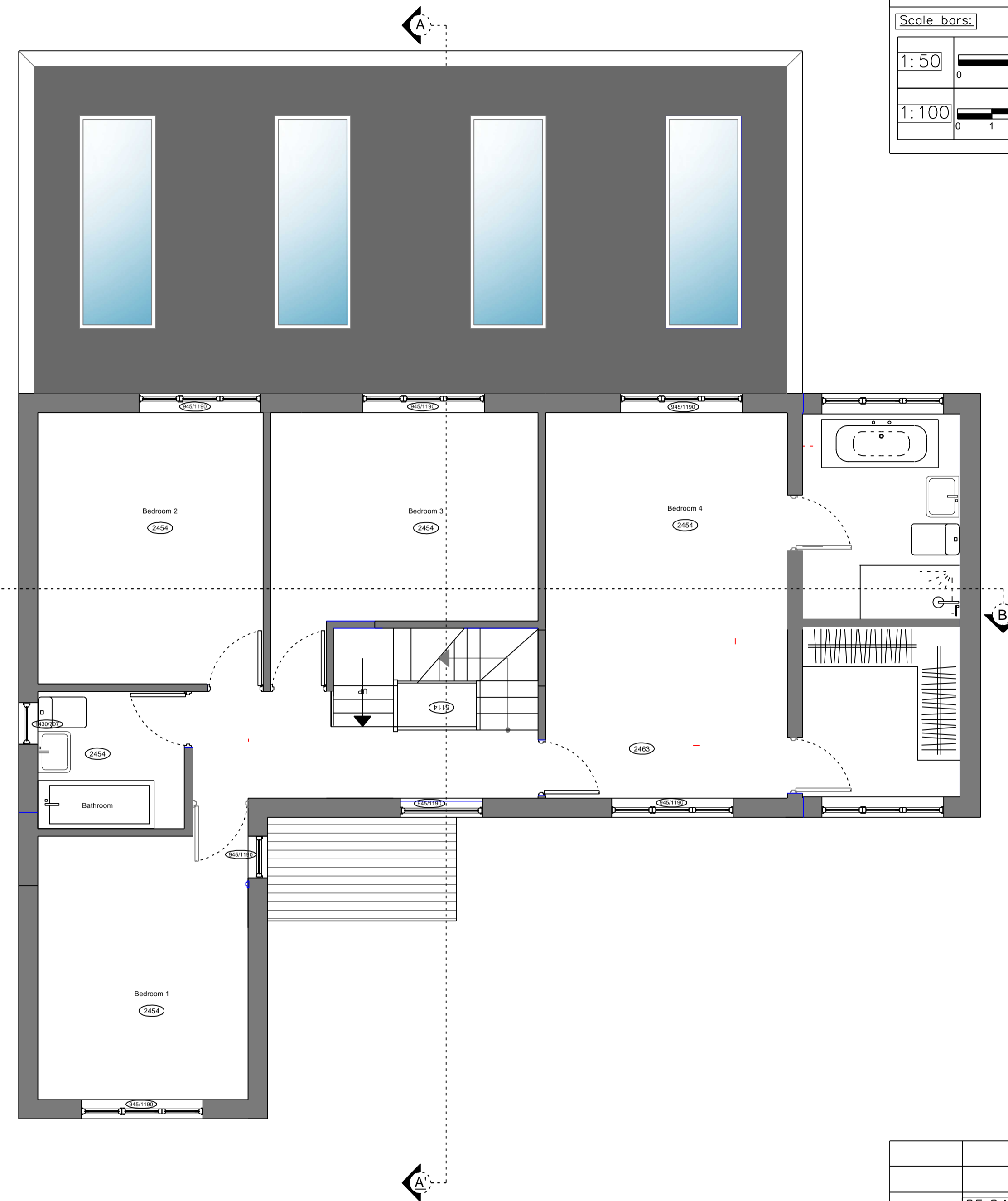
First Floor Plan 1:50