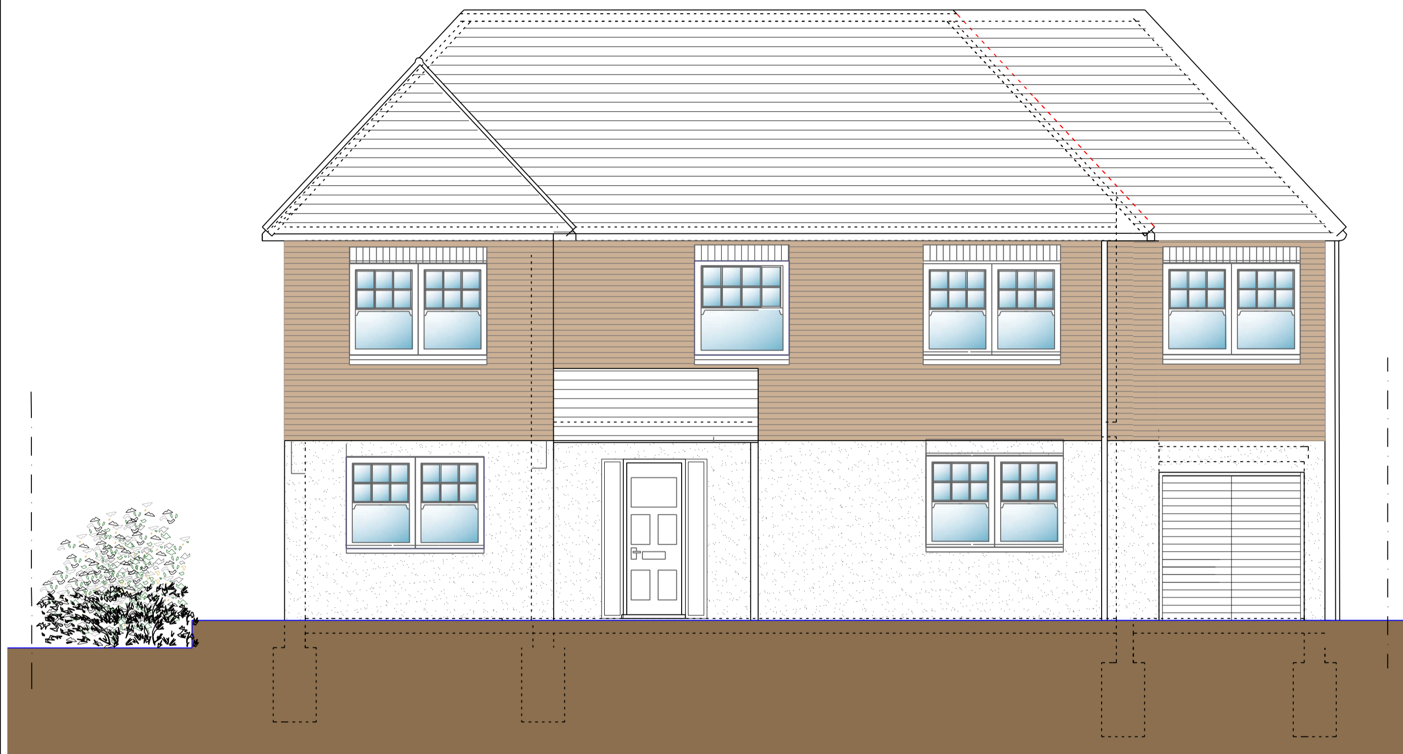
○ Front Elevation 1:50