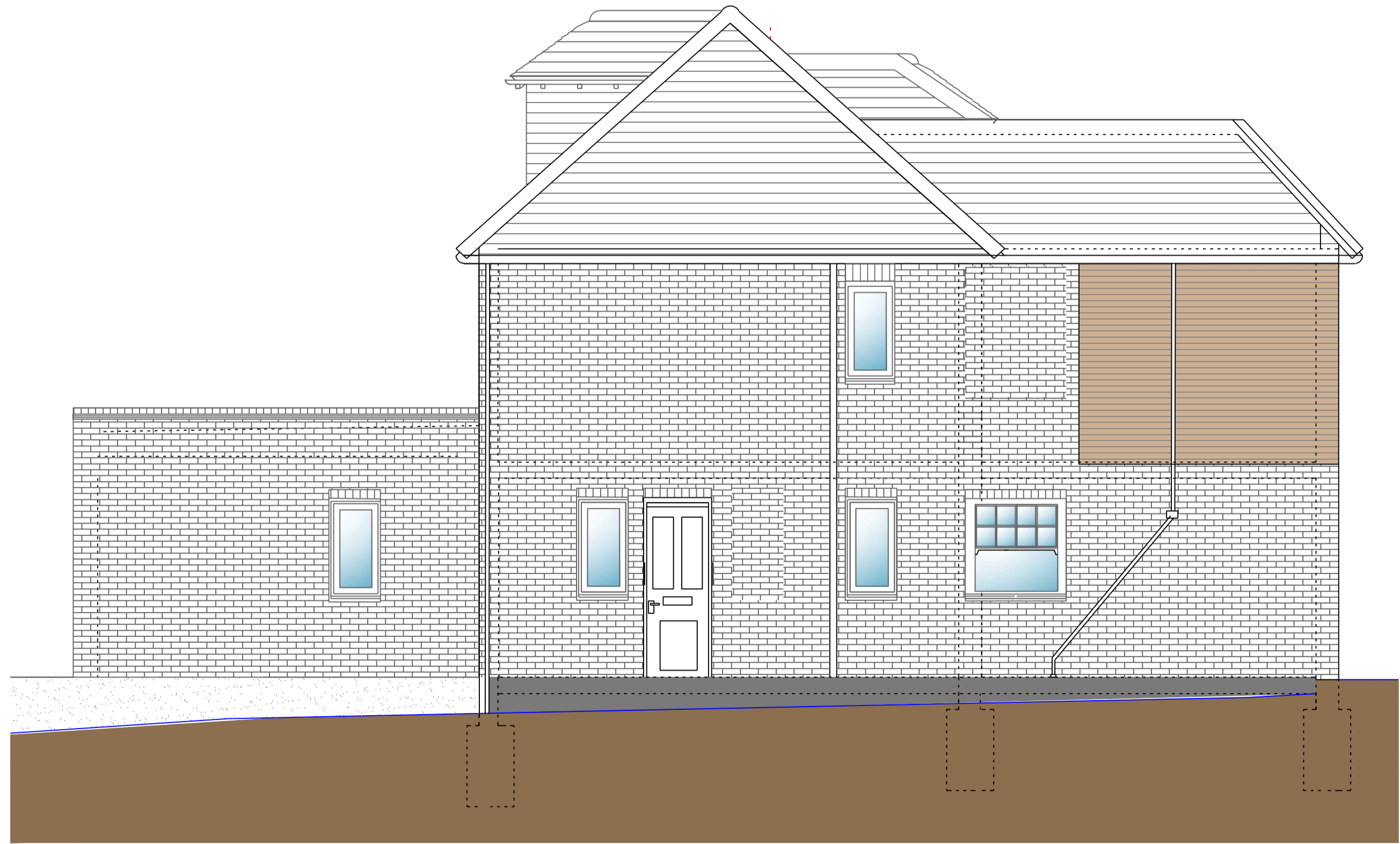
○ Side Elevation 2 1:50

NOTES GENERAL: GENERAL: • Work to figured dimensions and relative position only, confirm to designer • This drawing is to be read in conjunction with all relevant drawings, detailed specifications where applicable and all associated drawings in this series (if any) • Any discrepancy on this drawing is to be reported immediately to Oakman Architecture Ltd for clarification • The contractor is responsible for all temporary works and for the stability of the works in progress