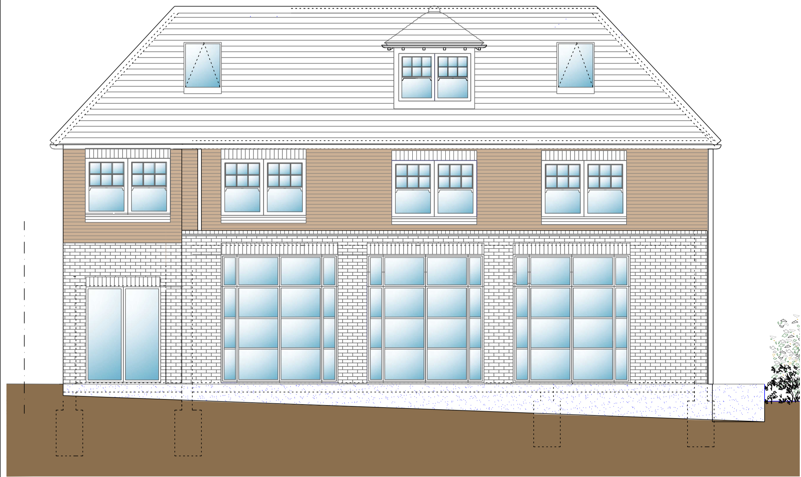
○ Rear Elevation 1:50