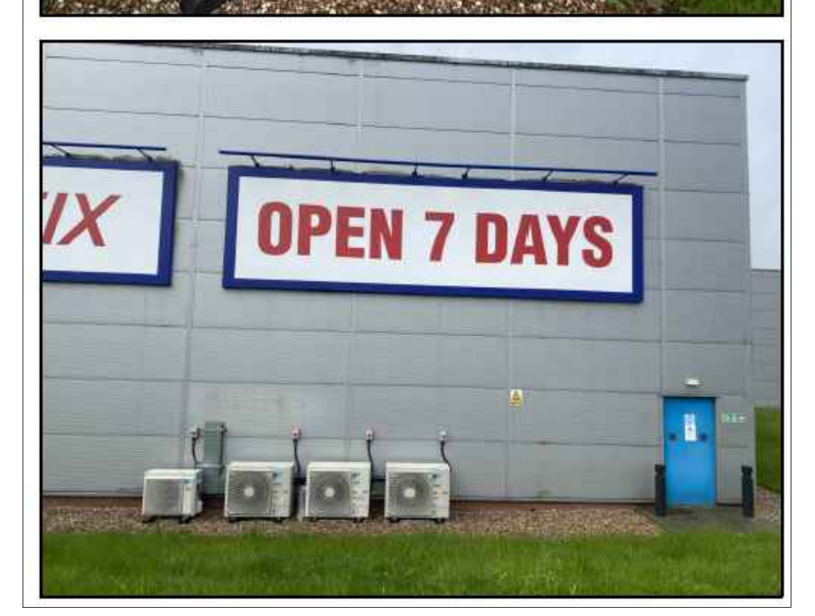
TYPICAL EXAMPLE OF AC UNITS FLOOR MOUNTED