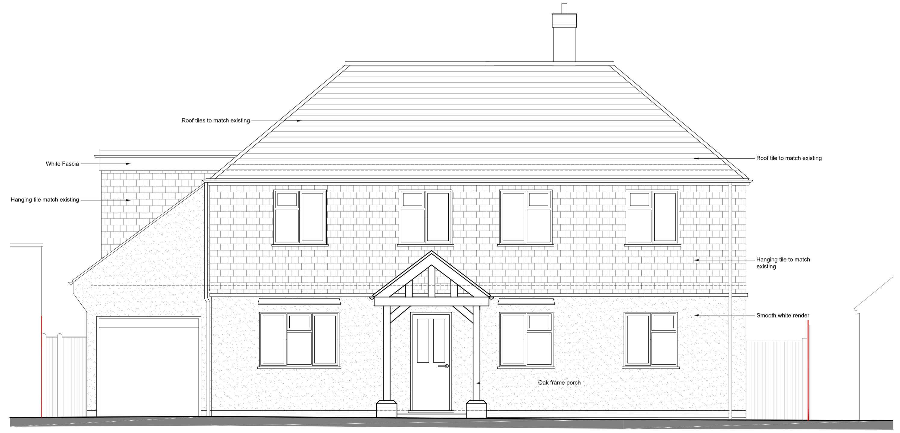
FRONT ELEVATION 1:50 1