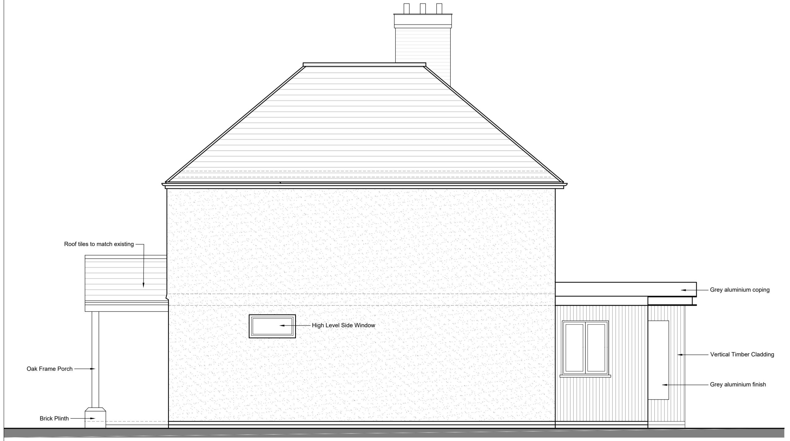
SIDE ELEVATION 1:50 2