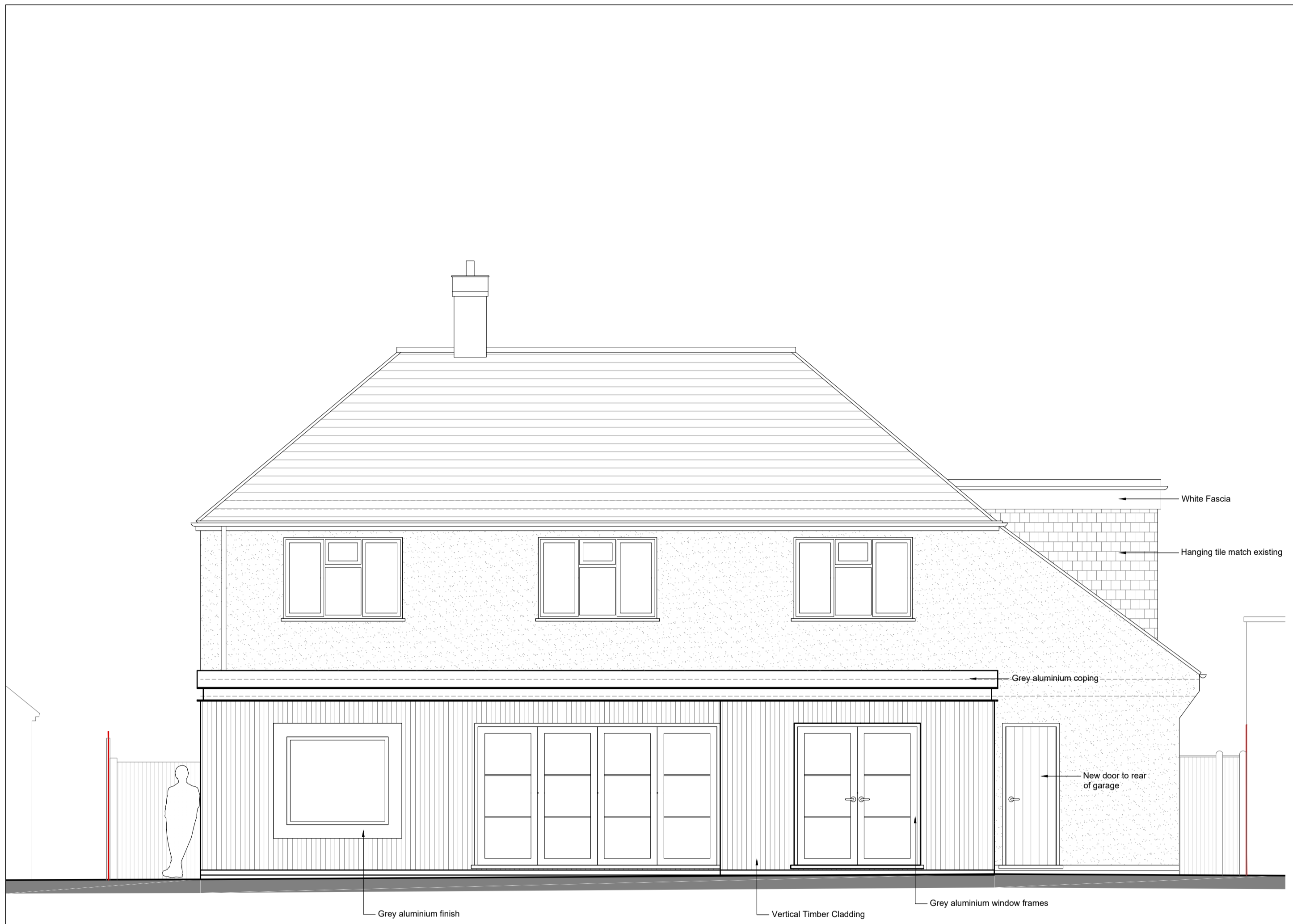
REAR ELEVATION 1:50 4