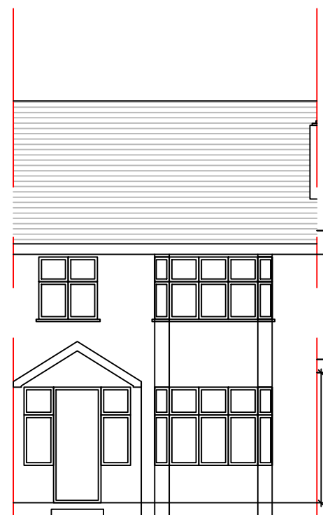
EXISTING FRONT ELEVATION SAME AS EXISTING

NOTES DO NOT SCALE. WORK TO FIGURED DIMENSIONS ONLY. CONTRACTOR TO CHECK ALL DIMENSIONS. ALL ERRORS AND OMISSIONS TO BE REPORTED TO THE ARCHITECT.