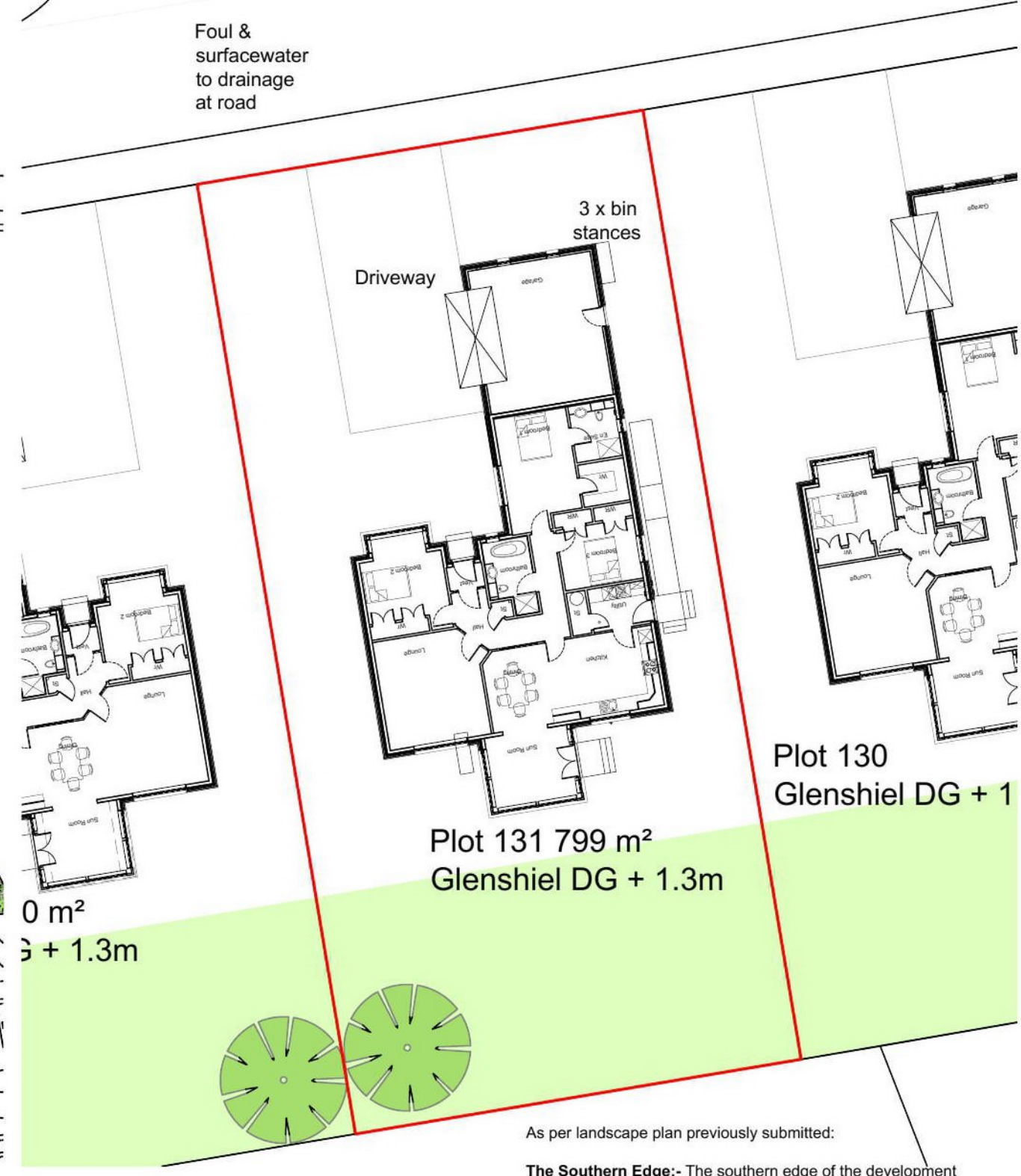
Site Plan 1:250

Contains Ordnance Survey data. © Crown copyright and database rights 2024. AC000849494