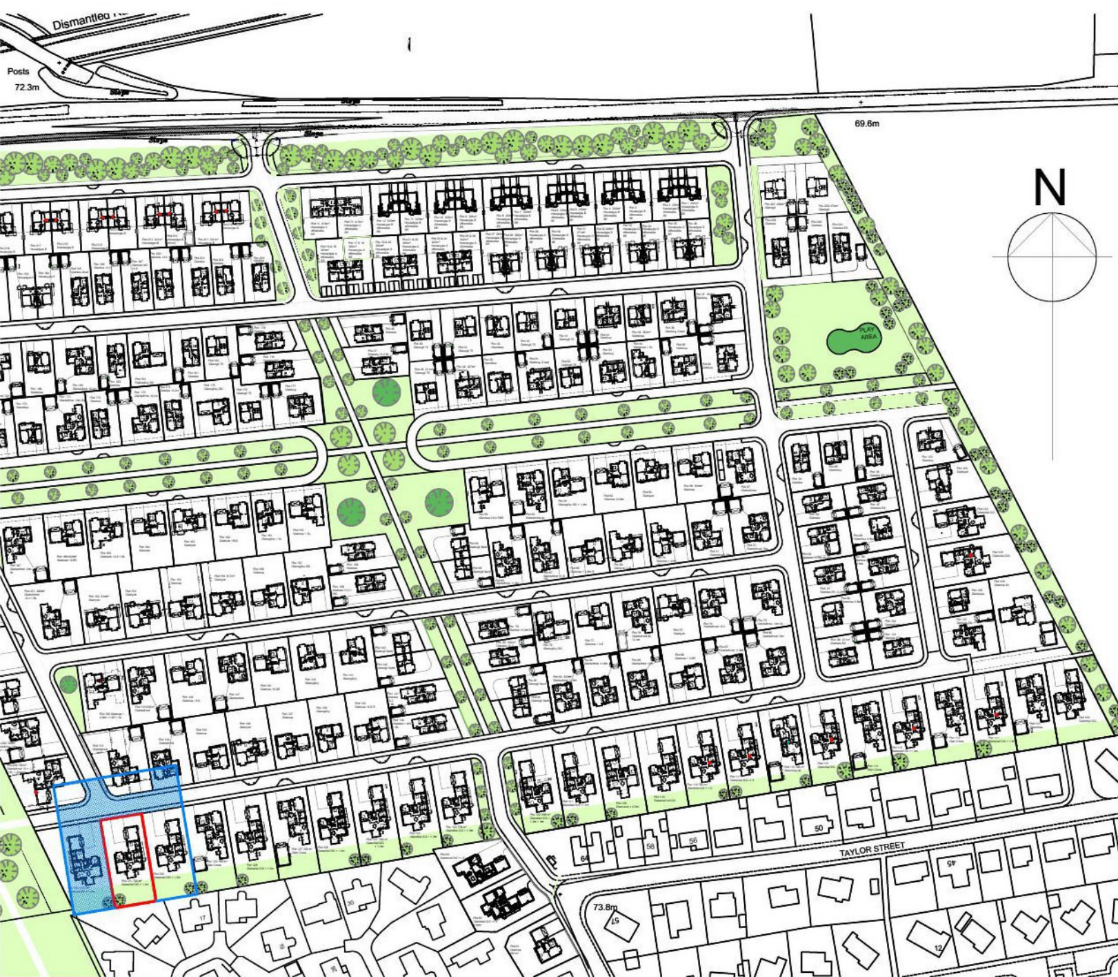
Location Plan 1:2500