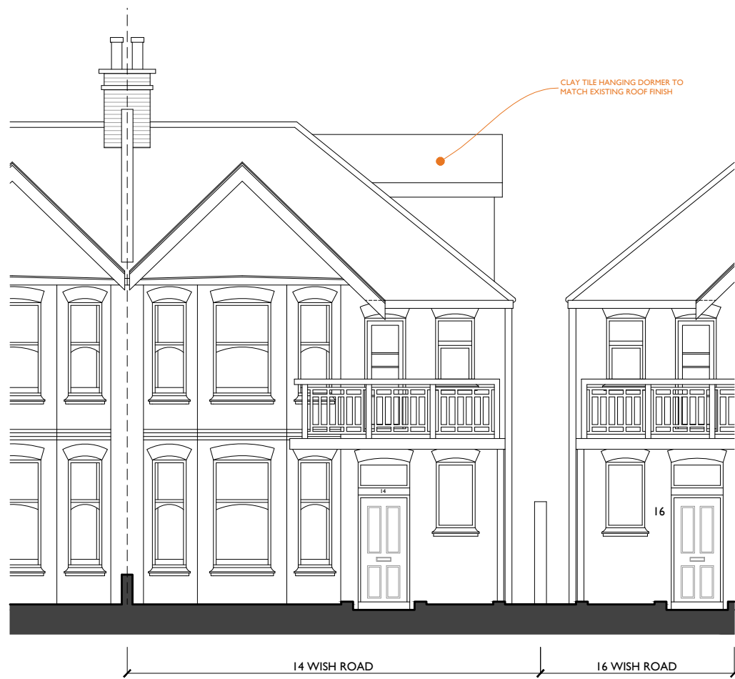
+EL Proposed east elevation - scale 1:100 at A3 Scale in Metres