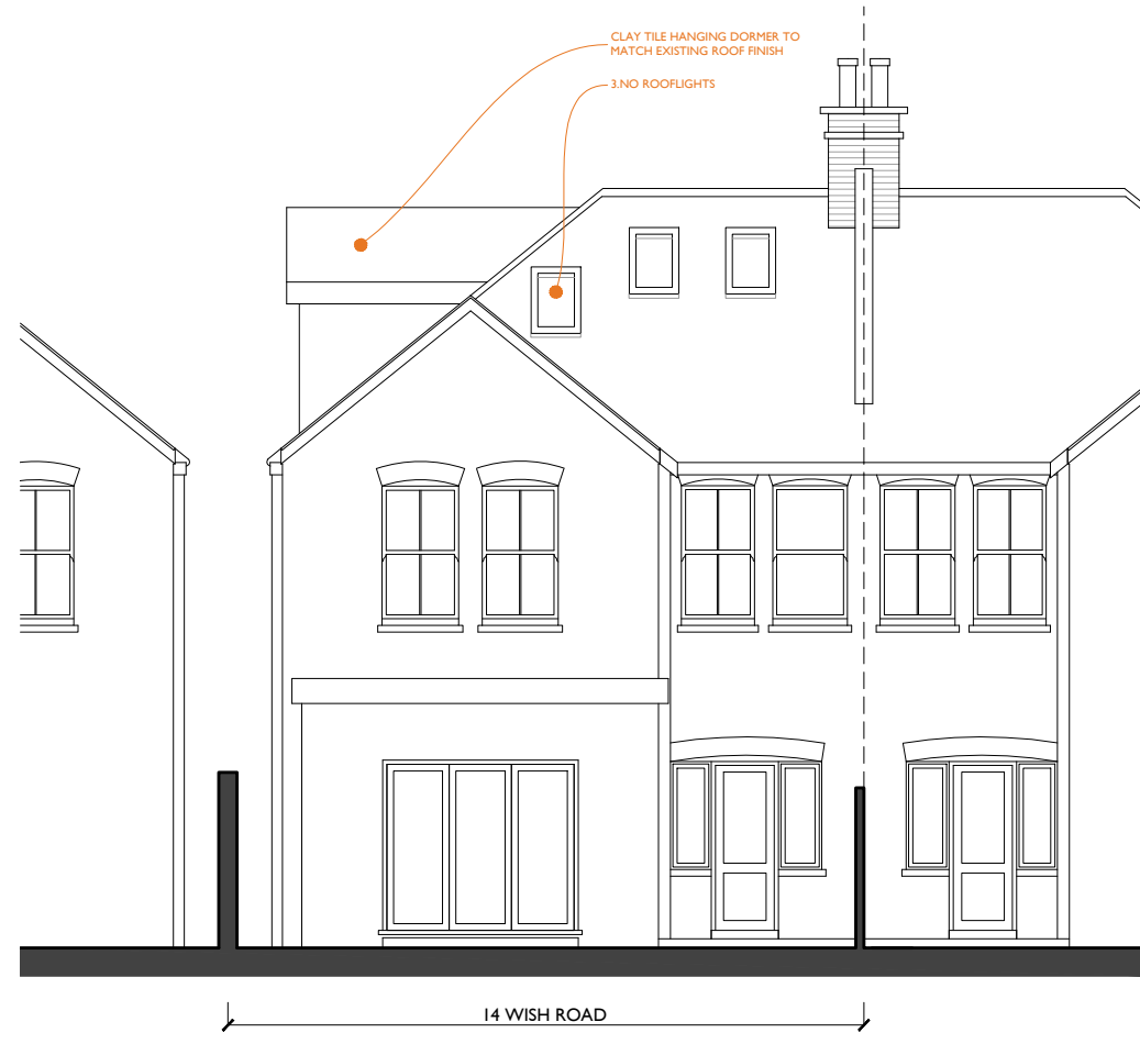
+EL Proposed west elevation - scale 1:100 at A3 Scale in Metres