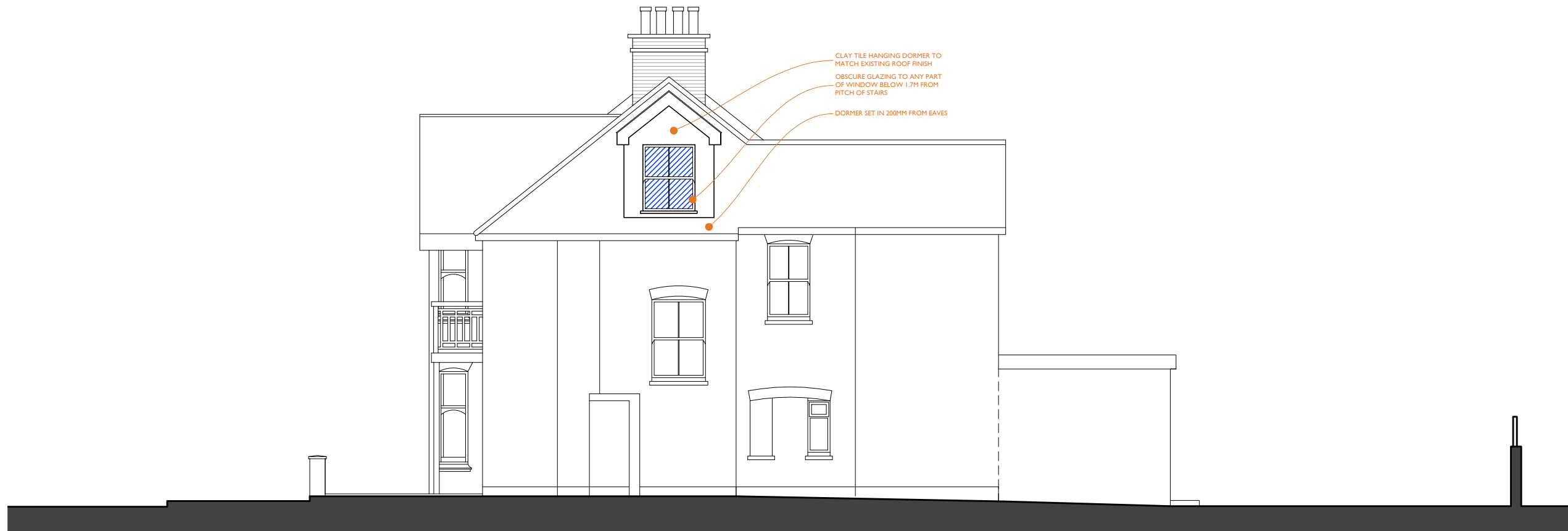
+EL Proposed north elevation - scale 1:100 at A3 Scale in Metres