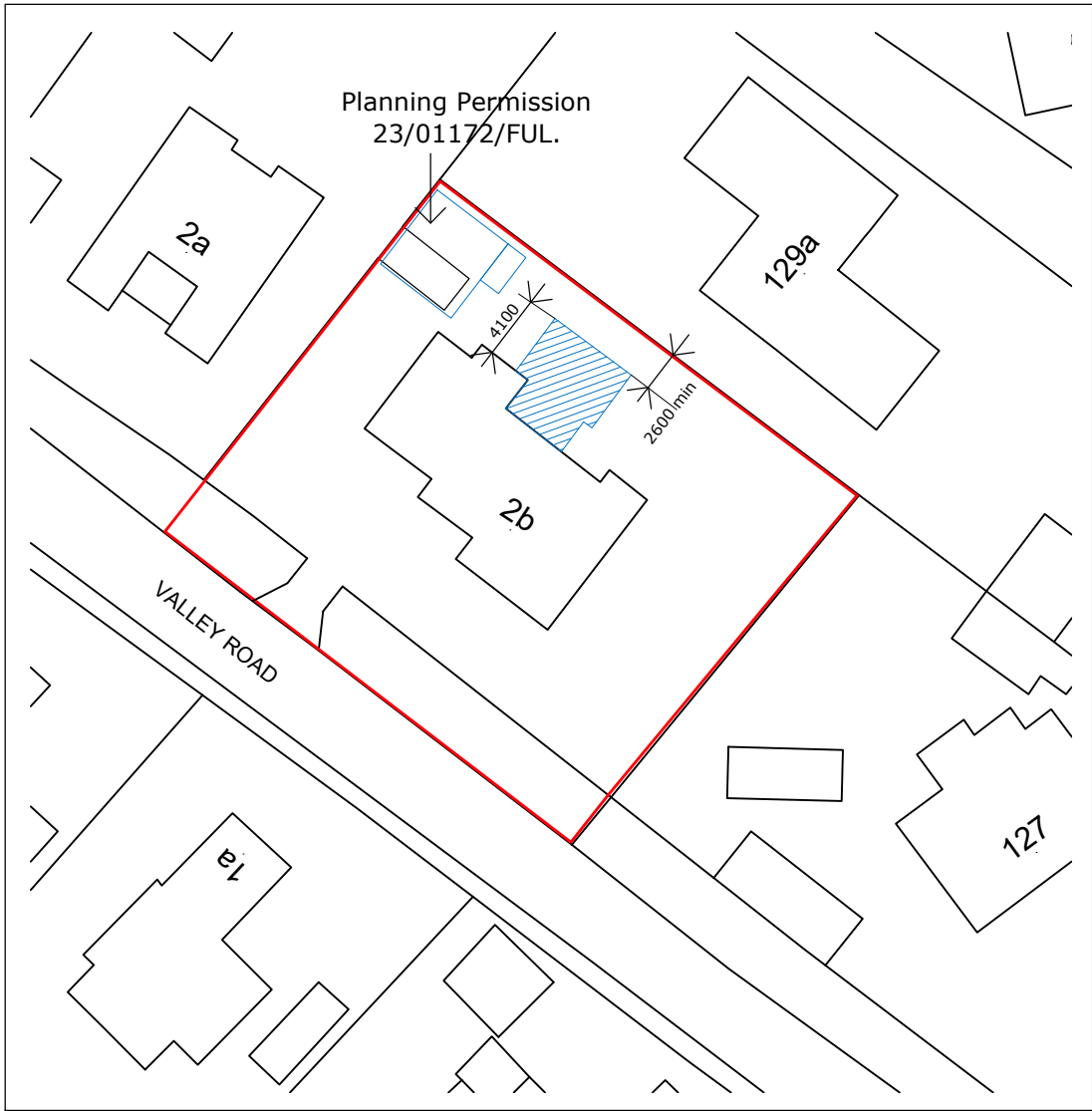
BLOCK PLAN 1:500 @ A4