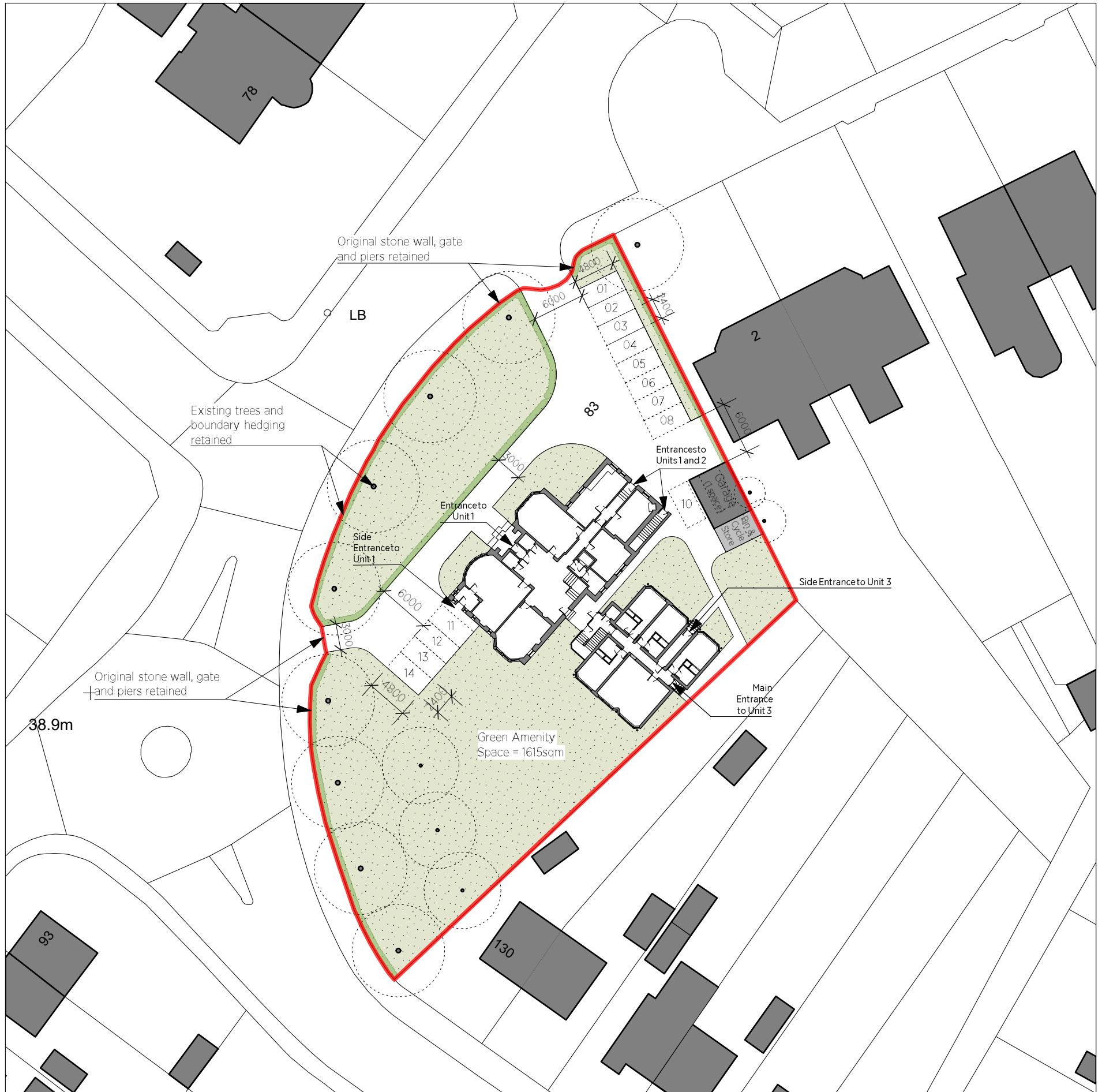
Site Plan as Proposed, 1:500