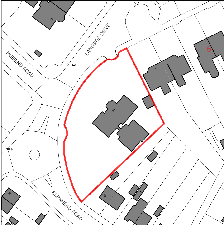
Location Plan, 1:1000

Do not scale from drawing. Use figured dimension only. All dimensions to be checked on site by the contractor and any discrepancies to be notified to the architect prior to works being carried out. Drawing is copyright of NVDC Architects Ltd.