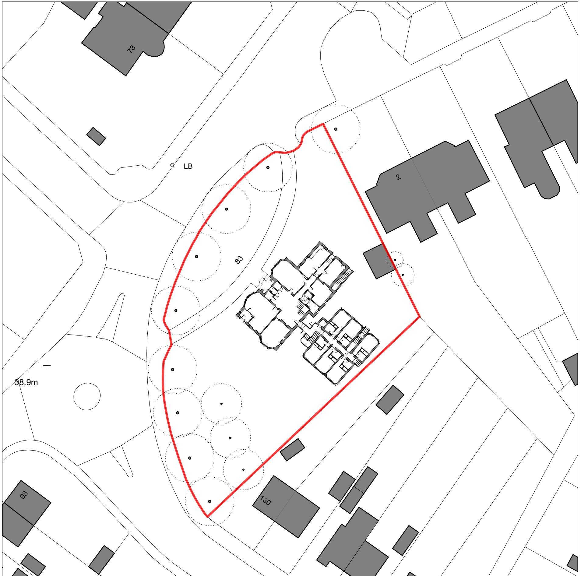
Site Plan as Existing, 1:500