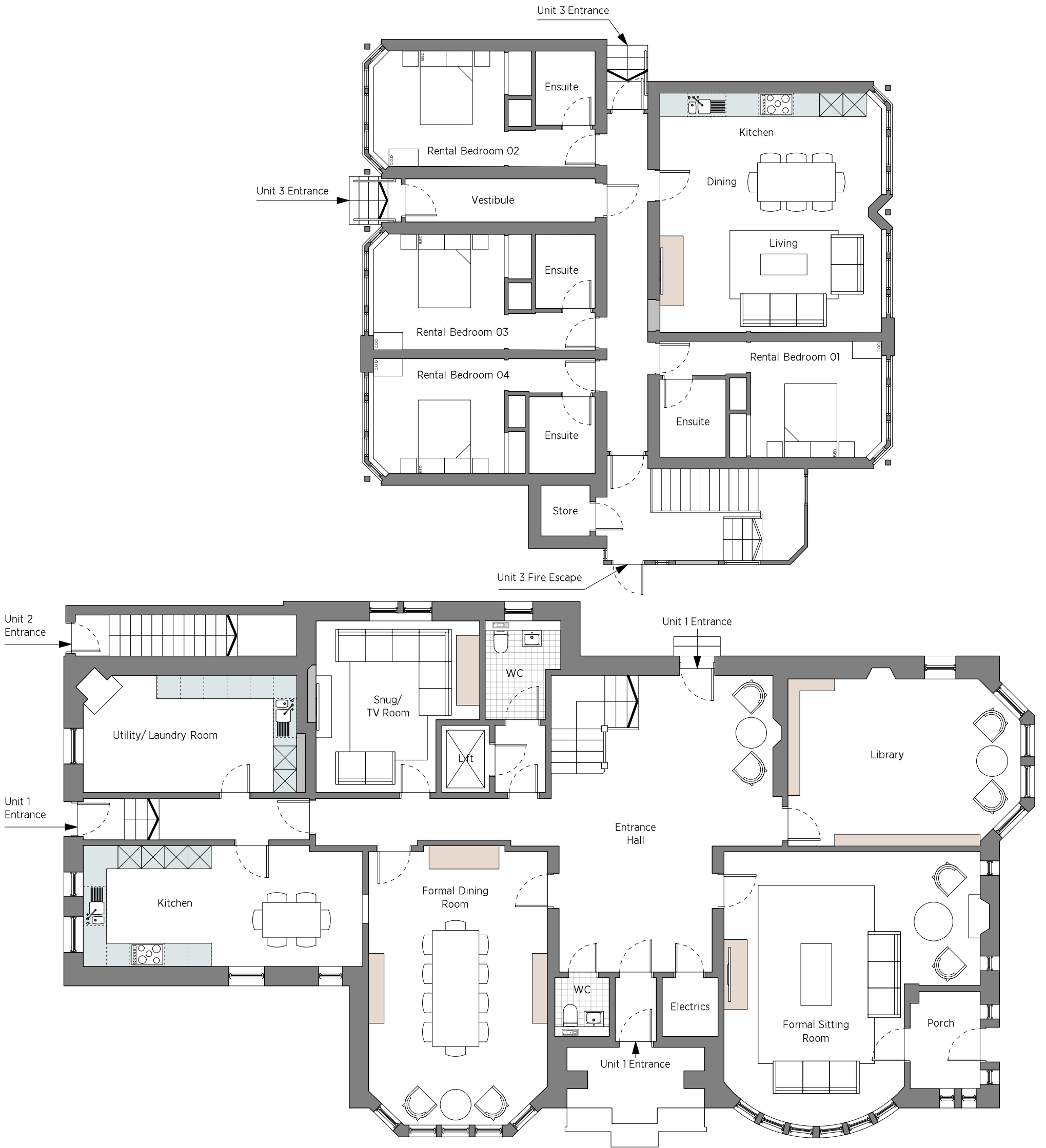
Ground Floor Plan as Proposed, 1:100

Do not scale from drawing. Use figured dimension only. All dimensions to be checked on site by the contractor and any discrepancies to be notified to the architect prior to works being carried out. Drawing is copyright of NVDC Architects Ltd.