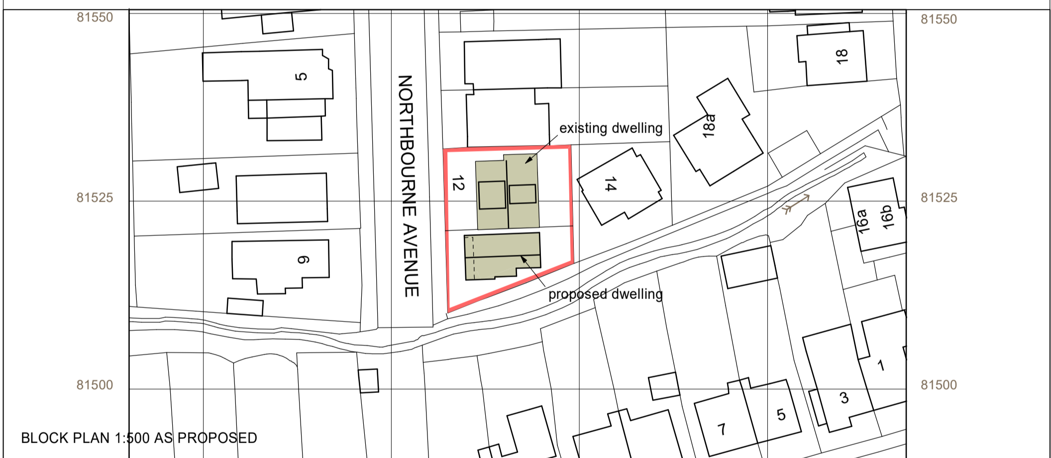
BLOCK PLAN 1:500 AS PROPOSED

© Crown copyright 2023 Ordnance Survey 100053143