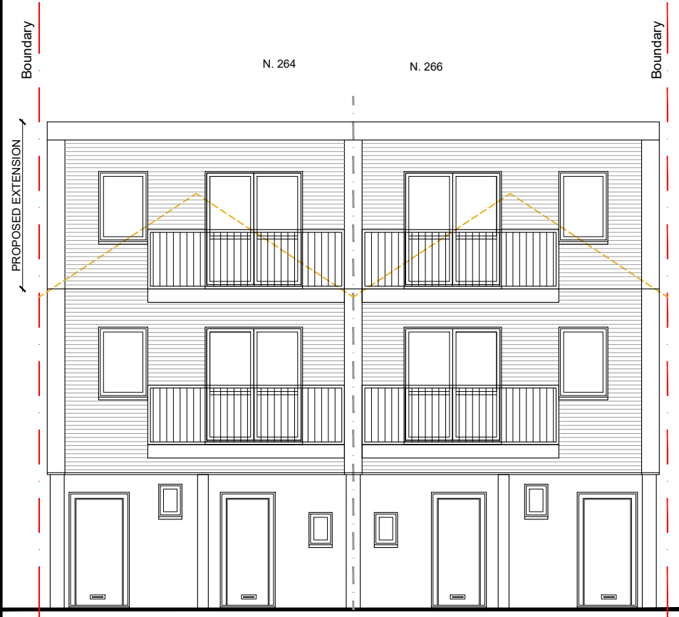
PROPOSED FRONT ELEVATION (NORTH-WEST FACING)