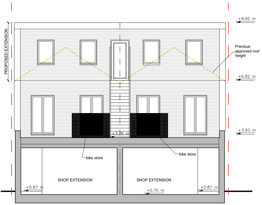
PROPOSED REAR ELEVATION (SOUTH-EAST FACING) SECTION C-C