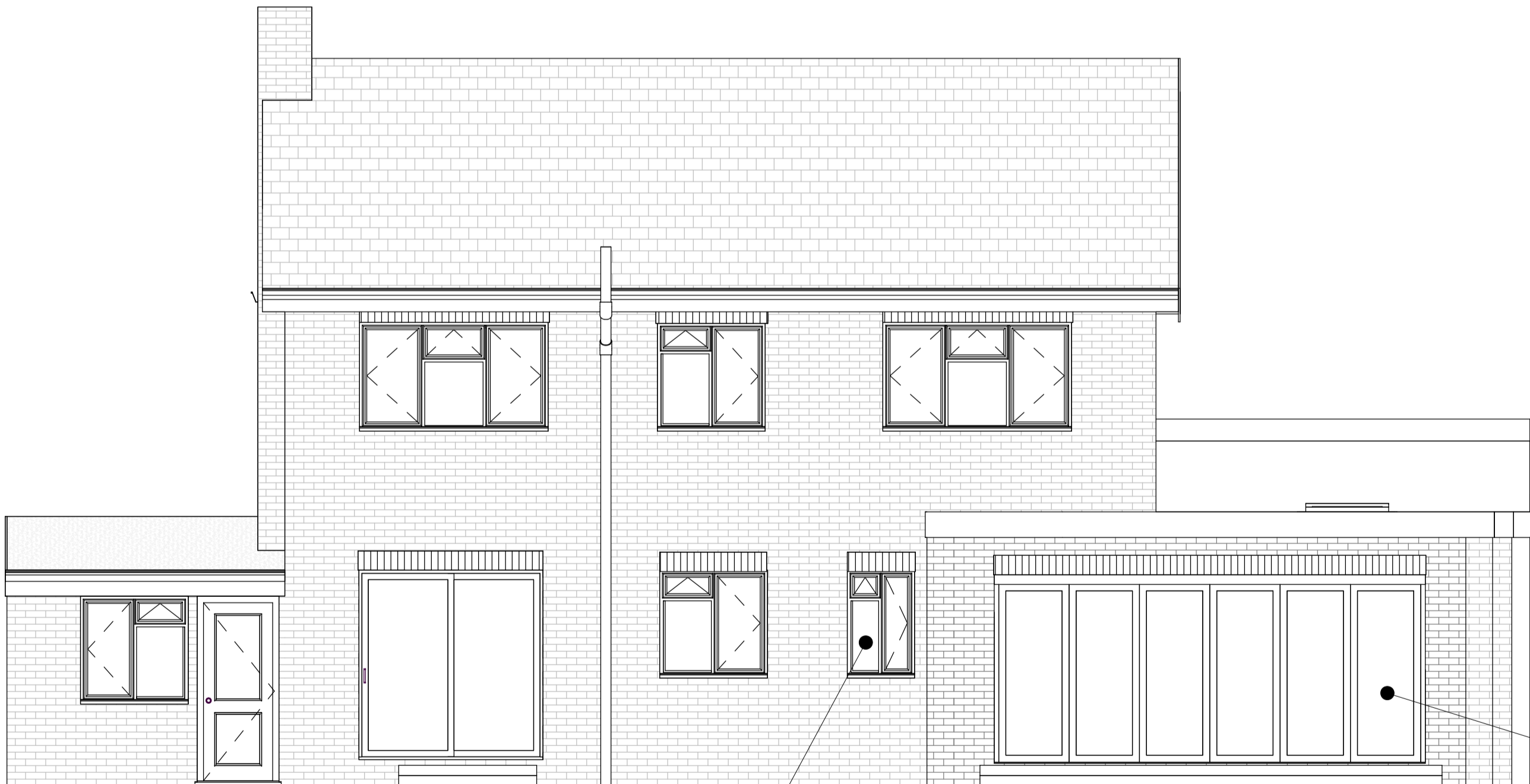
PROPOSED ELEVATION C