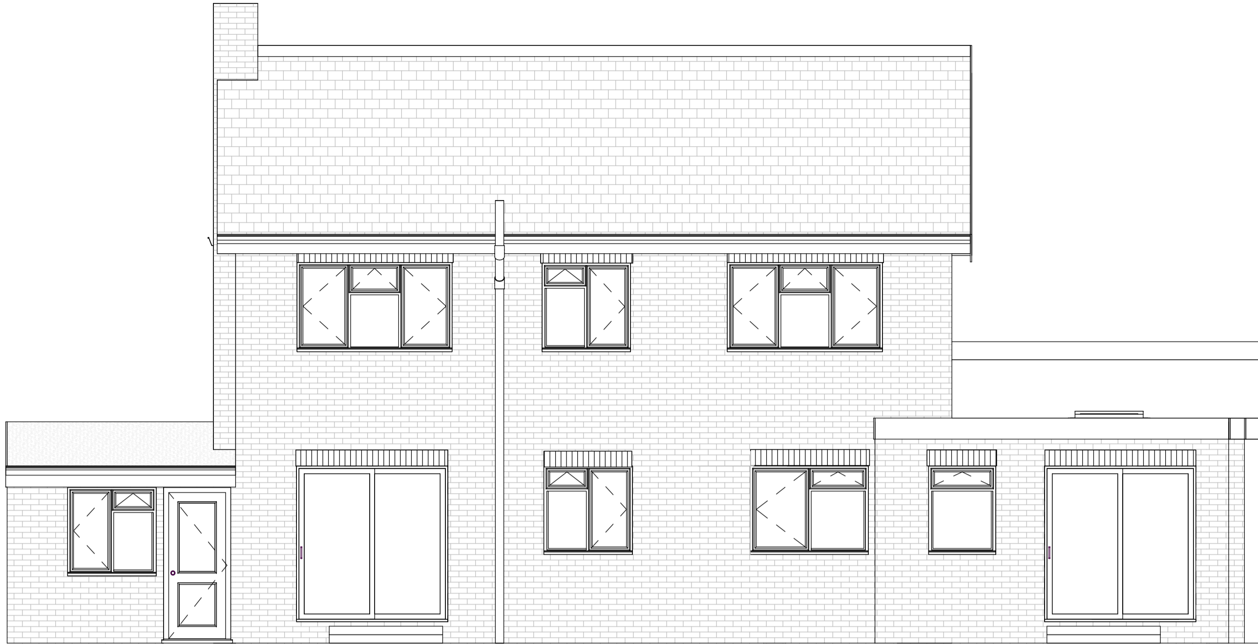
EXISTING ELEVATION C