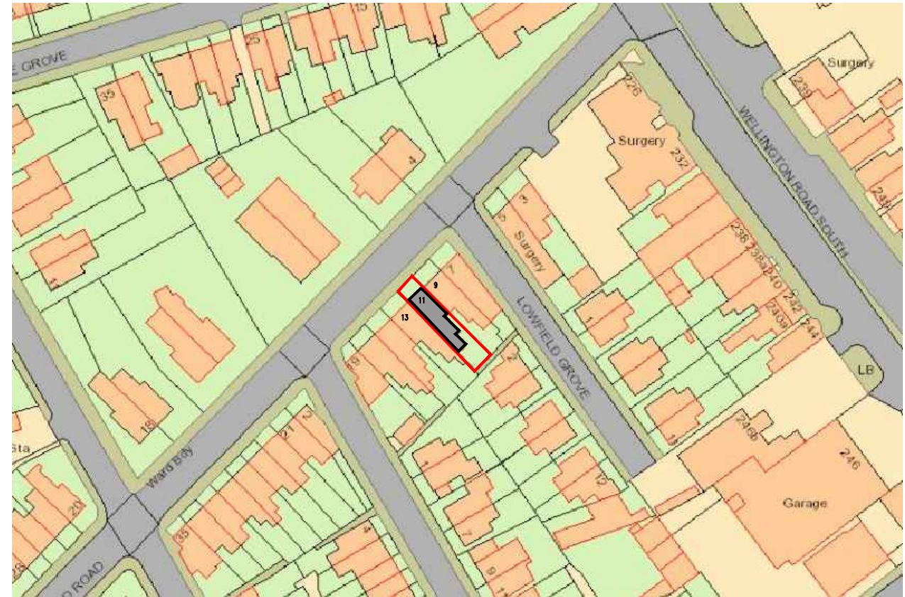
SITE LOCATION PLAN 1:1250@A4