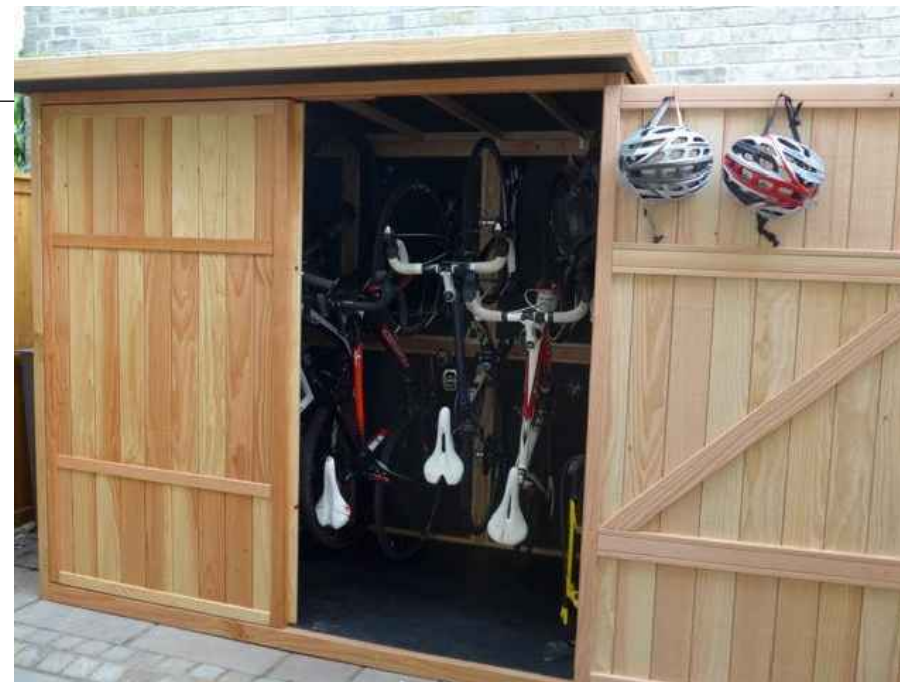
TIMBER SHED TO HOUSE 6 CYCLES WITH VERTICAL HANGERS. 2000mm LONG x 1400mm DEEP x 2000mm HIGH.