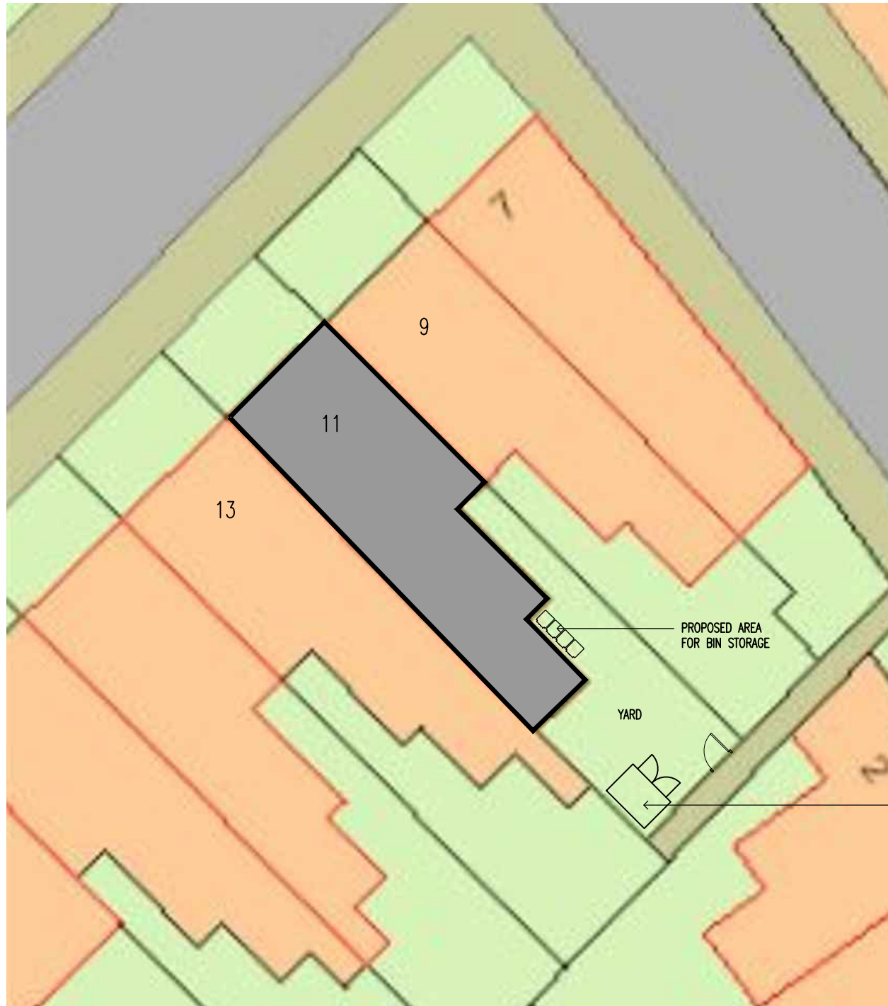
PROPOSED SITE PLAN 1:200@A4