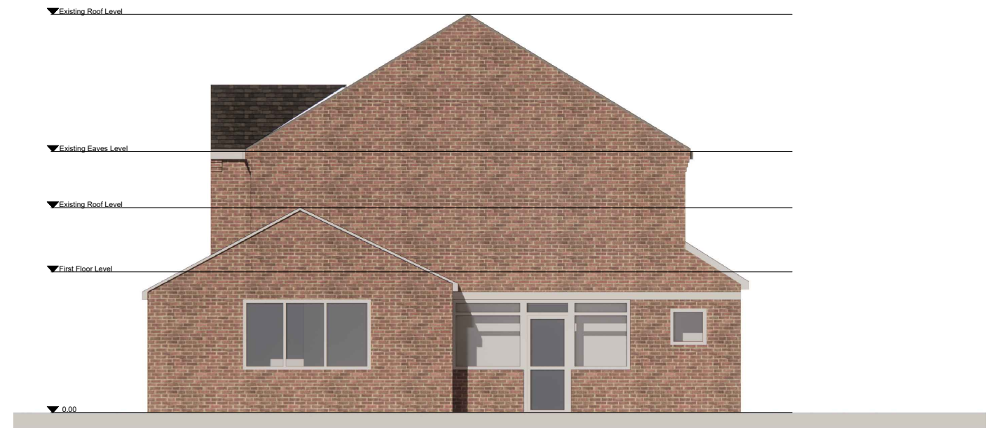
EXISTING SIDE ELEVATION TO No. 59