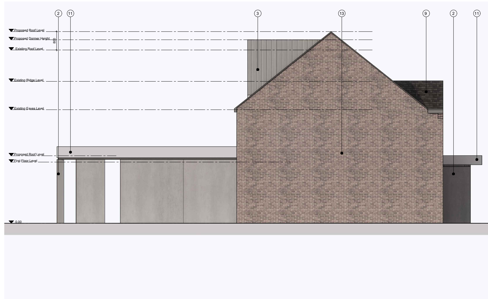
PROPOSED SIDE ELEVATION TO No. 59