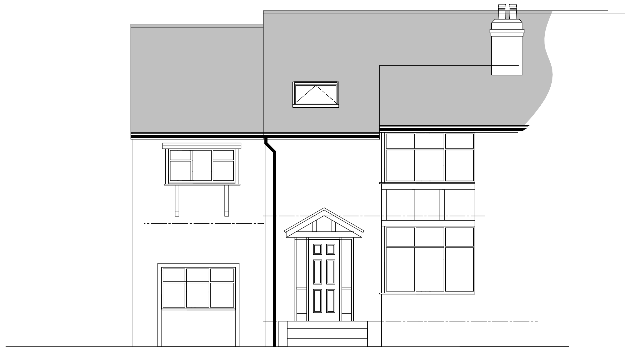
existing front elevation