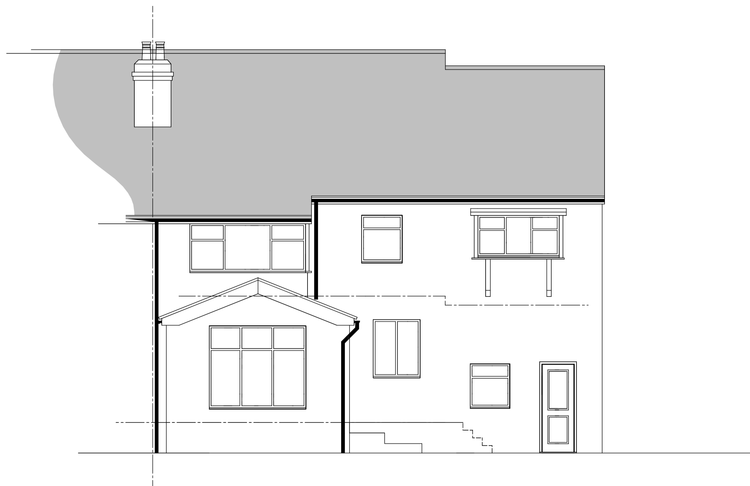
existing rear elevation