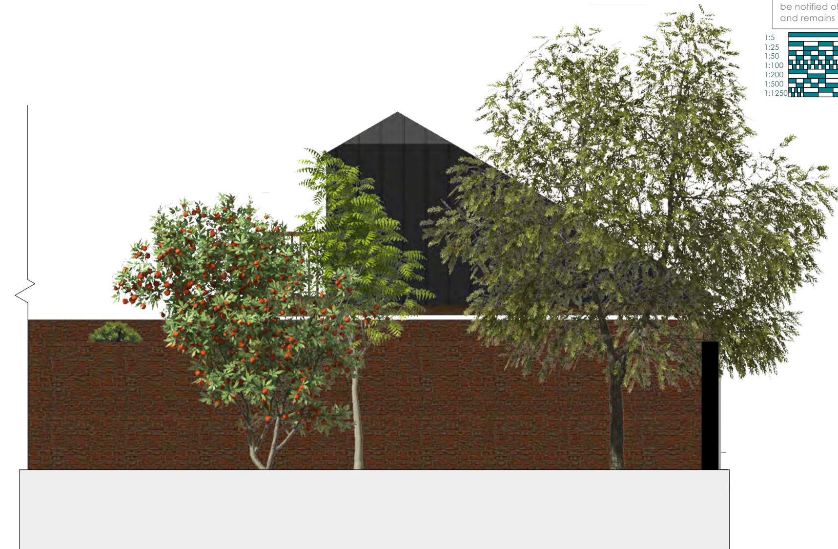
4 North East Elevation of Car Port Scale: 1:50

See Rear Elevation on drawing no. BSL-V-100-27 for further details of carport