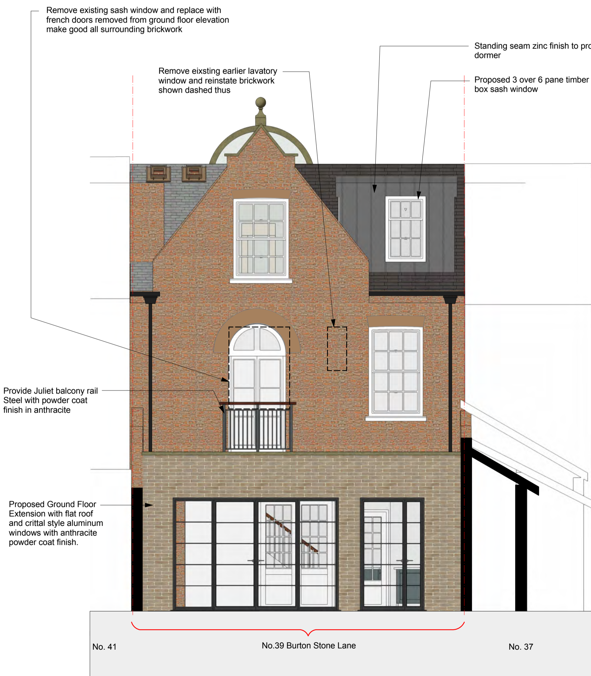
5 Proposed North West Elevation Thro' garden Scale: 1:50

See Rear Elevation on drawing no. BSL-V-100-27 for further details of carport