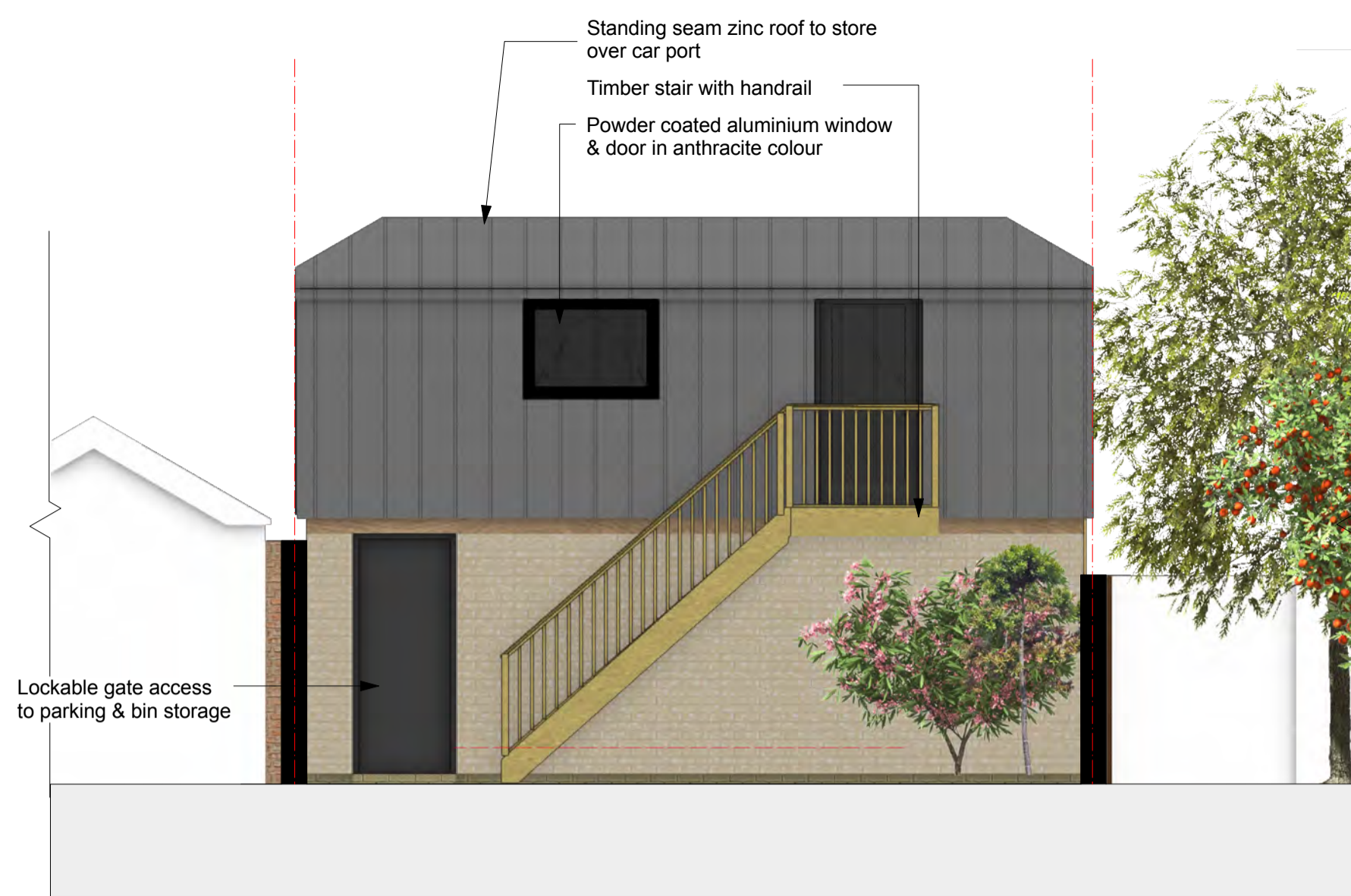
2 South East Elevation of Car Port Thro' Garden Scale: 1:50