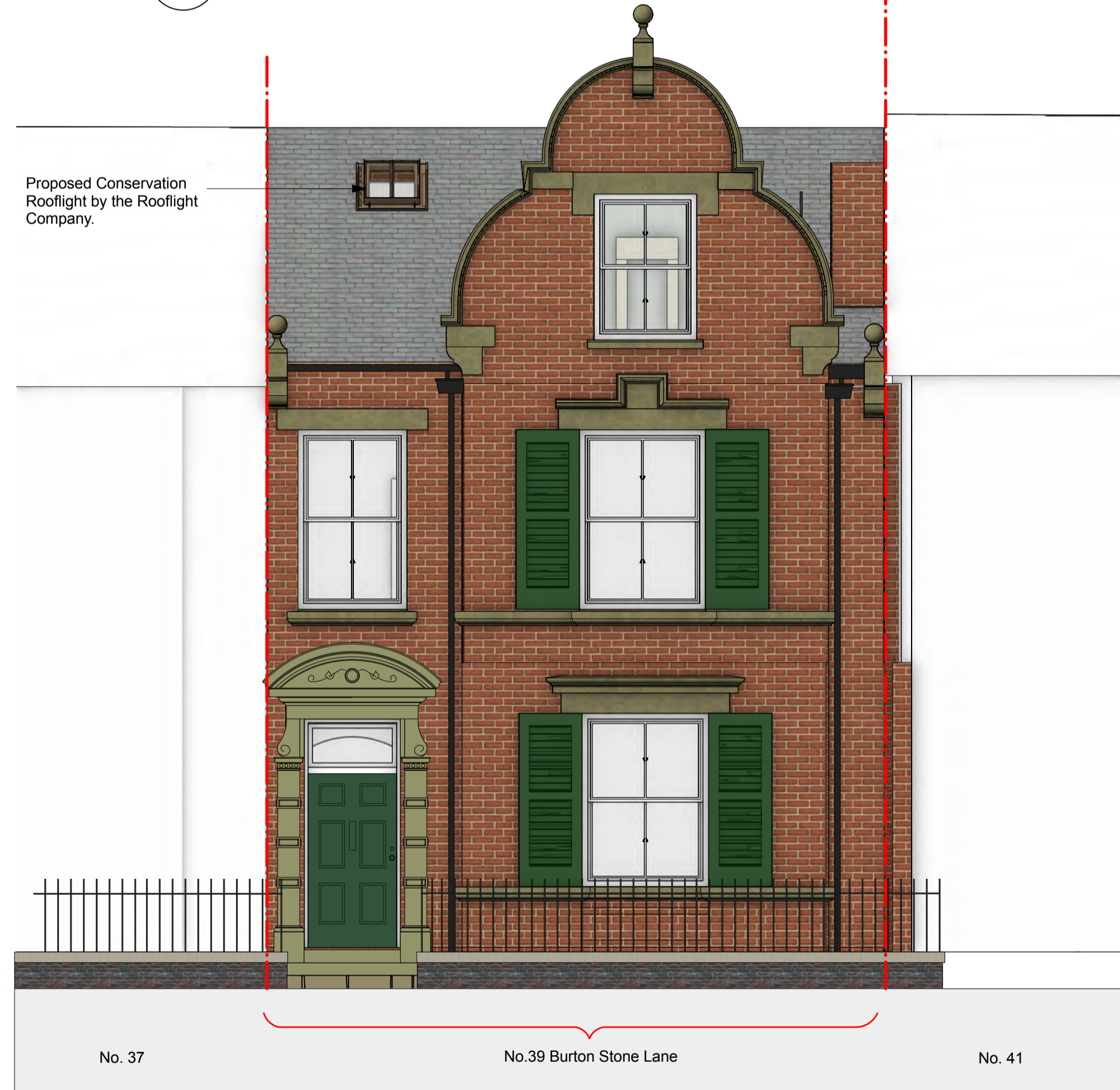
1 South East (Front) Elevation Scale: 1:50

Front Elevation remains unchanged Fenestrationally. Windows to be replaced with timber box sashes 2 over 2 with DG units finished in white paint. Some repairs to sand stone detailing as required