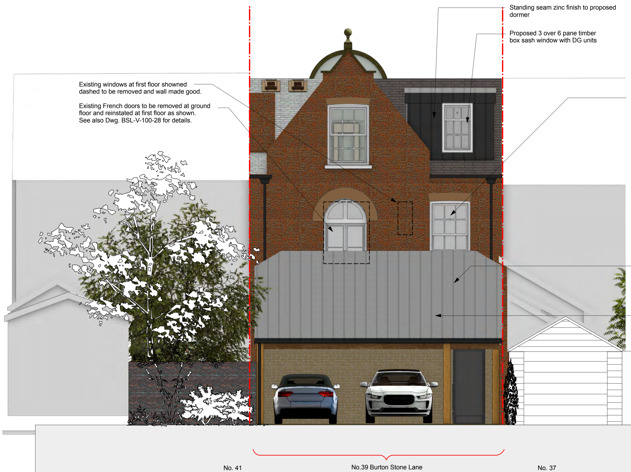
2 North West (Rear) Elevation Scale: 1:50

Front Elevation remains unchanged Fenestrationally. Windows to be replaced with timber box sashes 2 over 2 with DG units finished in white paint. Some repairs to sand stone detailing as required