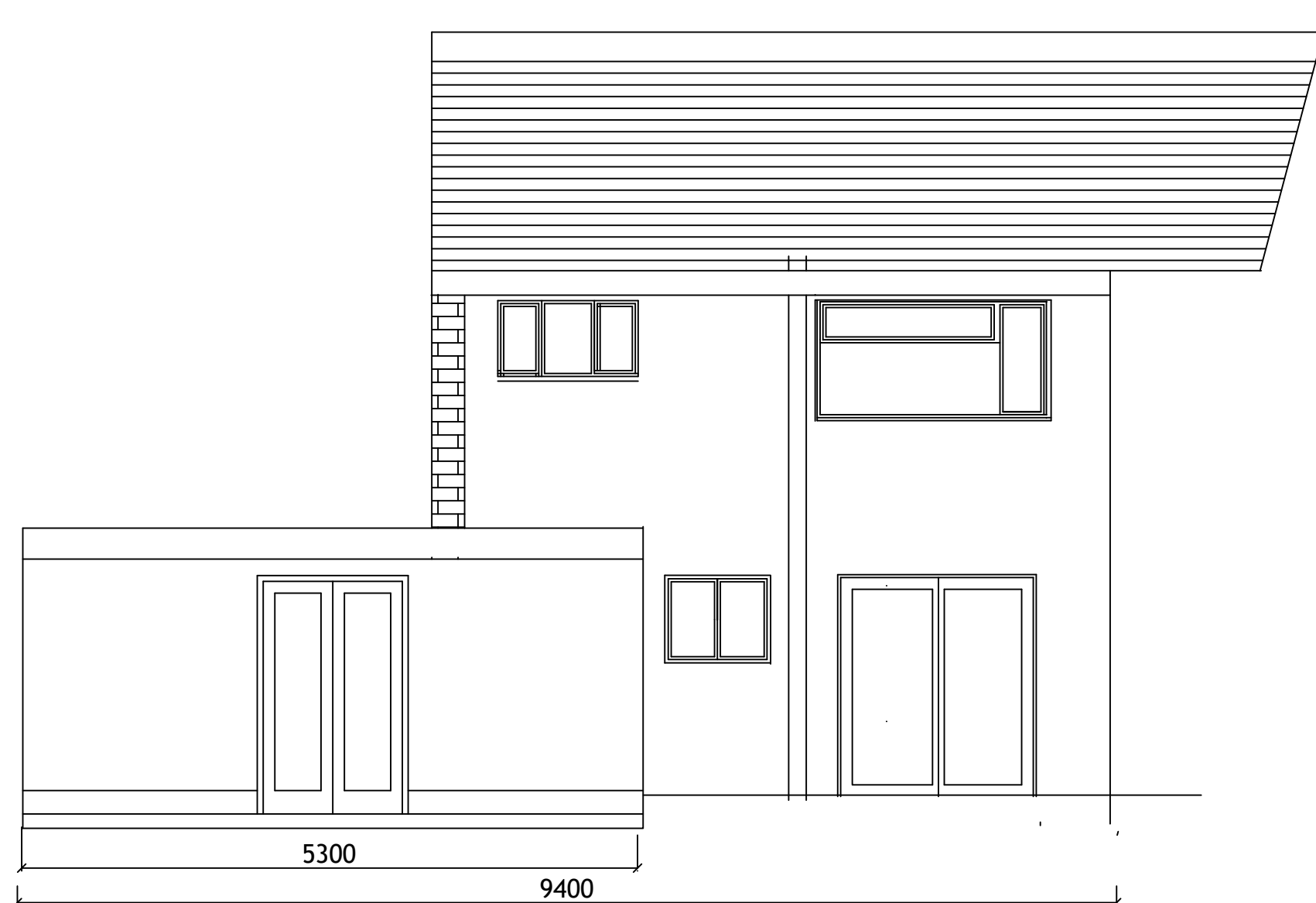
REAR ELEVATION (PROPOSED)