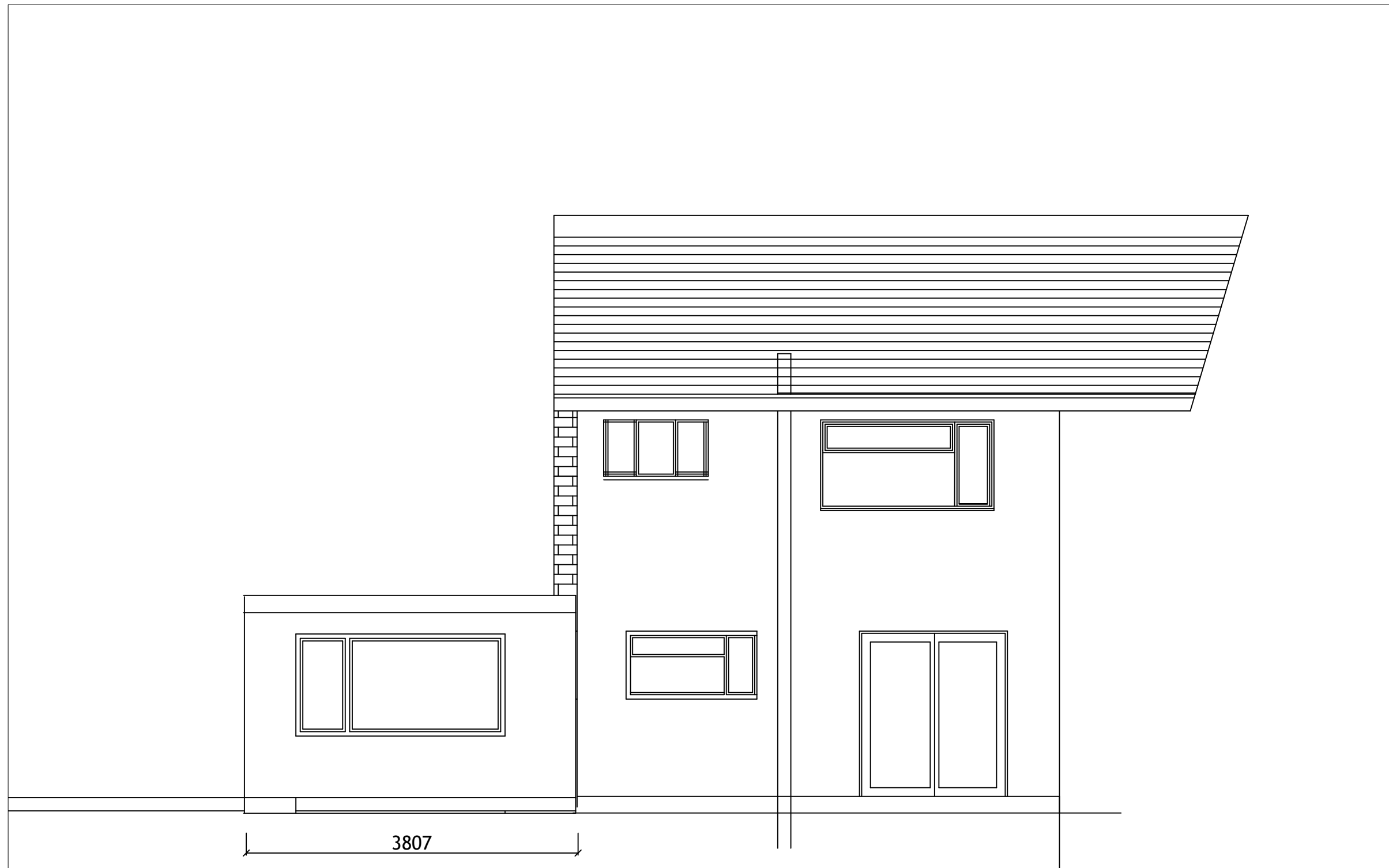
REAR ELEVATION (EXISTING)