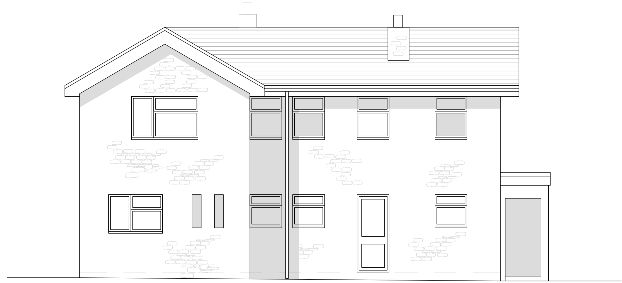
NORTH FRONT ELEVATION