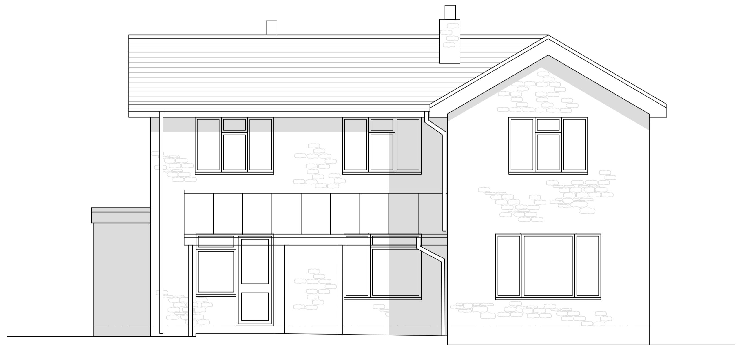
SOUTH REAR ELEVATION