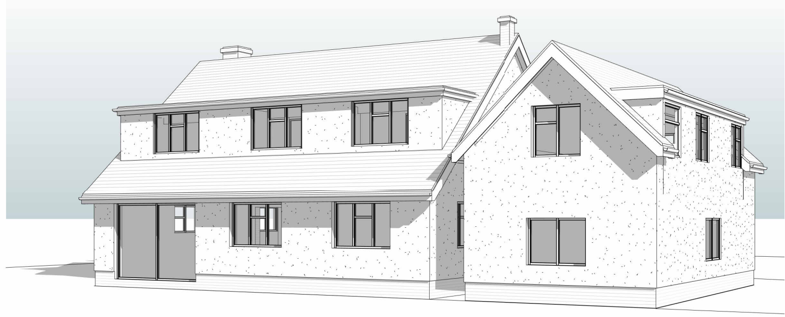
5 Existing Concept 3D View Rear