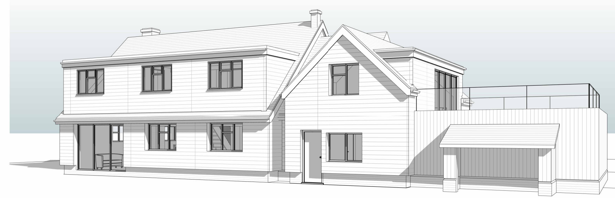
6 Proposed Concept 3D View Rear