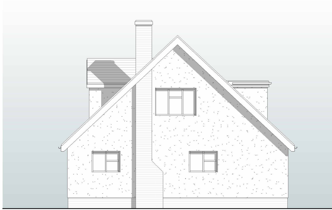
1 Existing Side Elevation 1 1 : 100

DO NOT SCALE FROM THIS DRAWING. WORK TO FIGURED DIMENSIONS ONLY. THIS DRAWING IS THE COPYRIGHT OF THE ARCHITECTS AND SHOULD NOT BE REPRODUCED WITHOUT THEIR EXPRESS PERMISSION