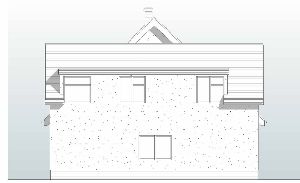
4 Existing Side Elevation 1 : 100