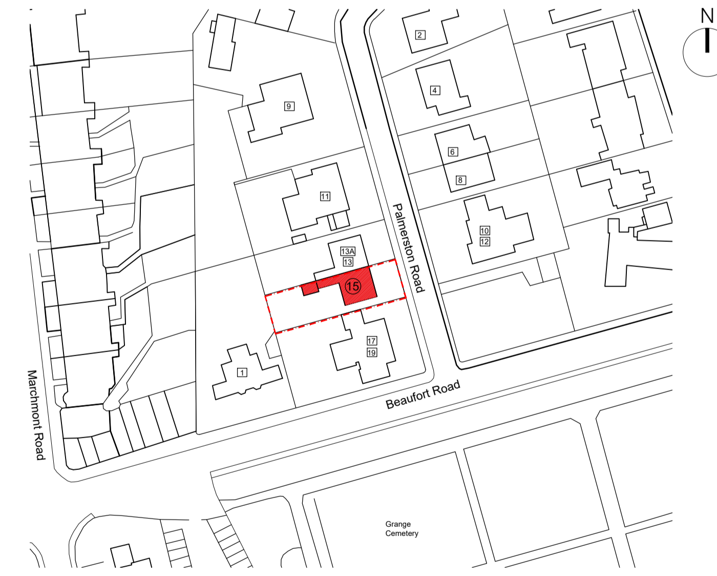
Location Plan (scale 1:1250)