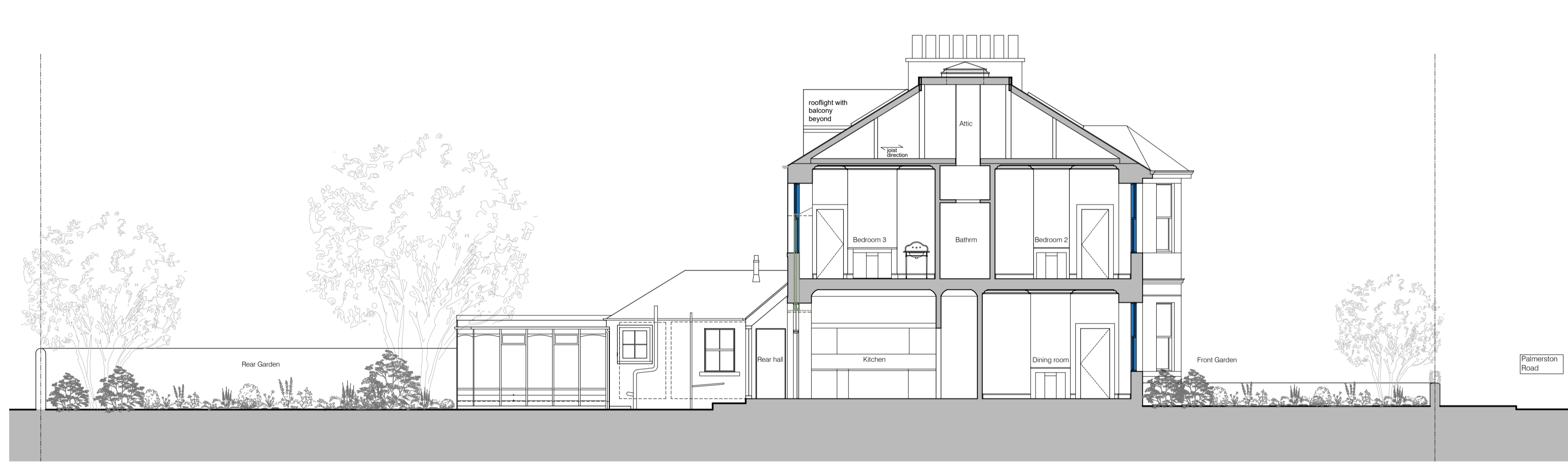
Proposed Section A (scale 1:100)