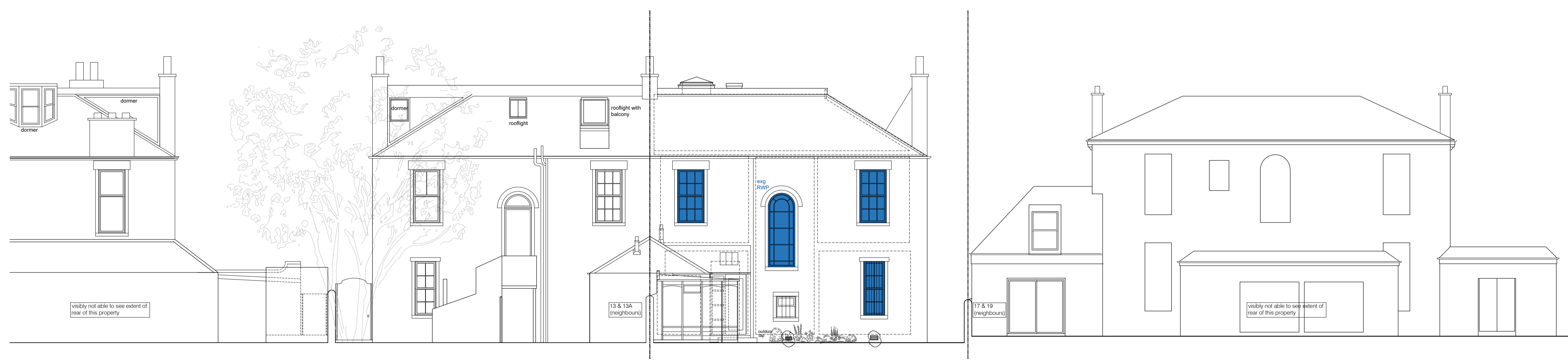
Proposed West Elevation (scale 1:100)