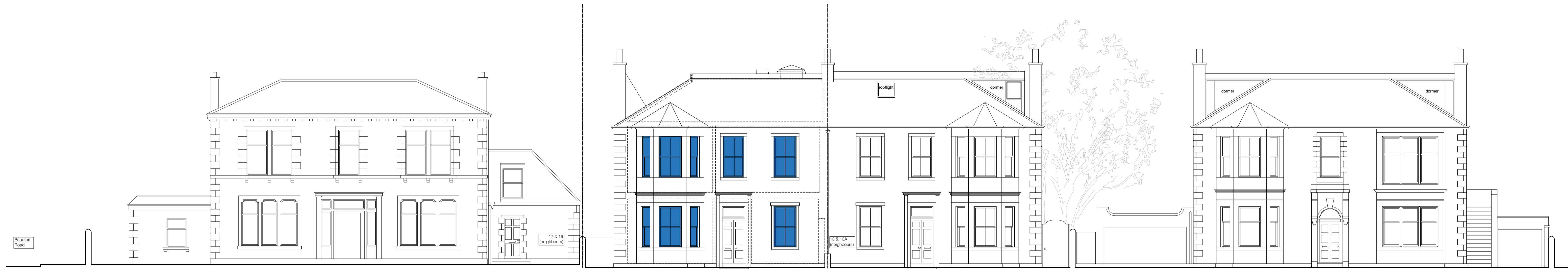
Proposed East Elevation (scale 1:100)