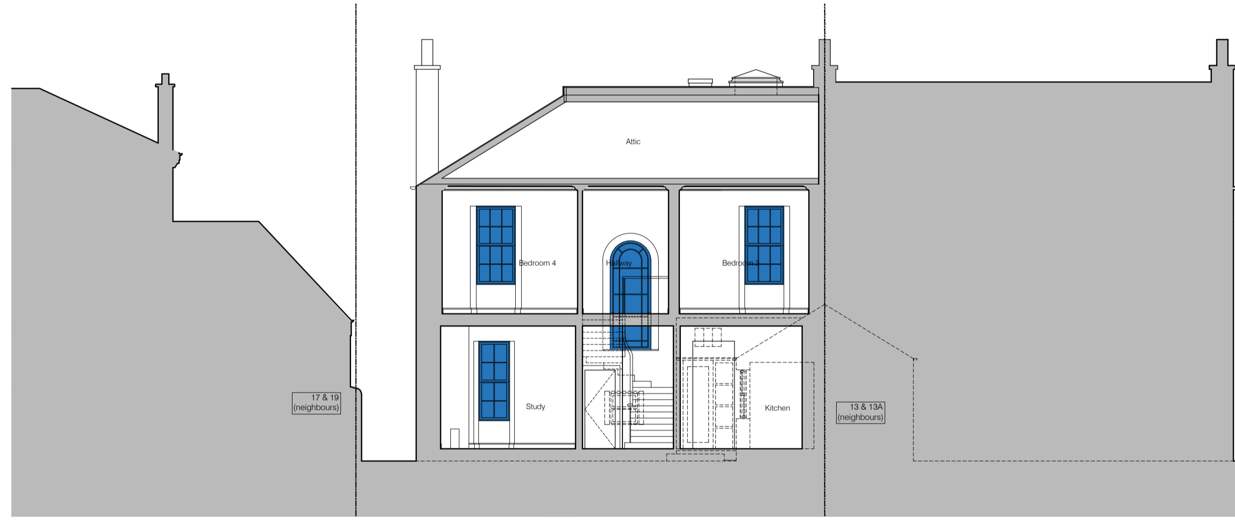
Proposed Section B (scale 1:100)