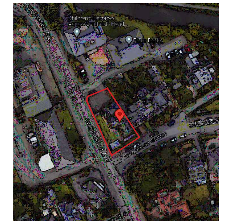
aerial view - n.t.s

Site area = 532.7 sq m Ex. Building footprint area = 160.6 sq m