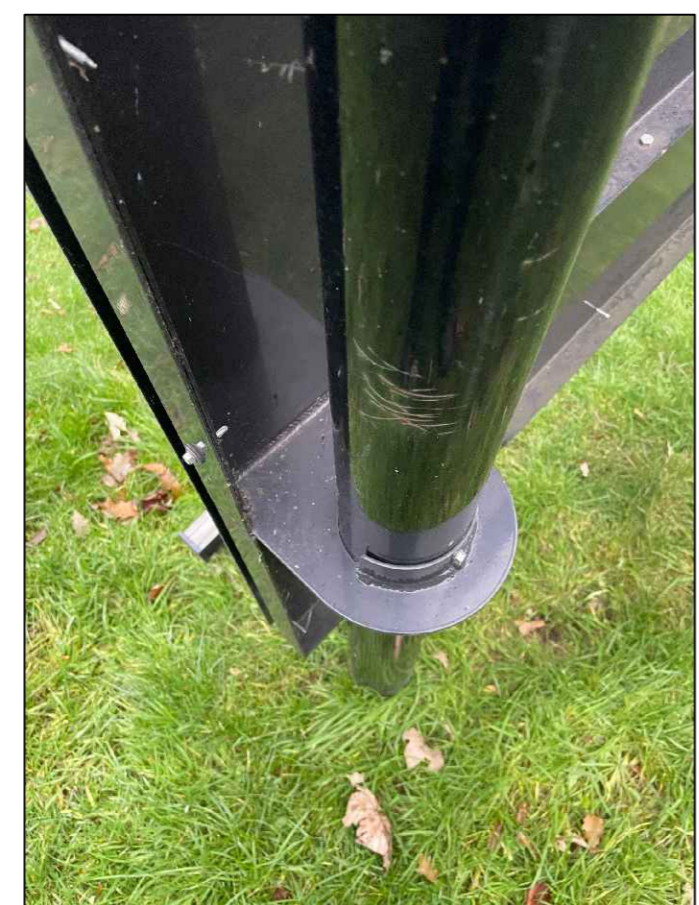
Photo of end column support bracket