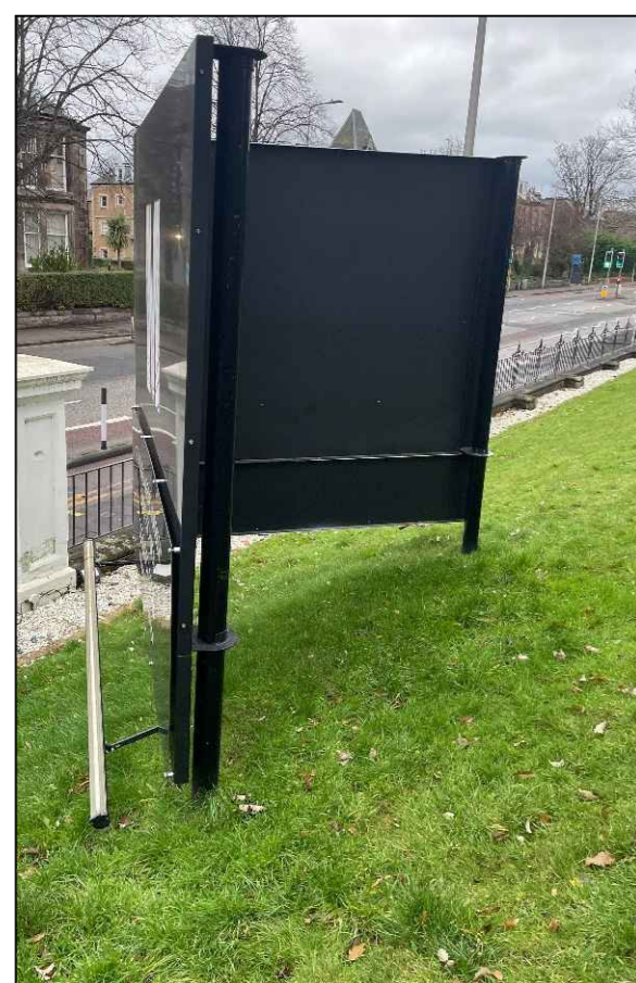
Photo of similar sign in use elsewhere

Site area = 532.7 sq m Ex. Building footprint area = 160.6 sq m