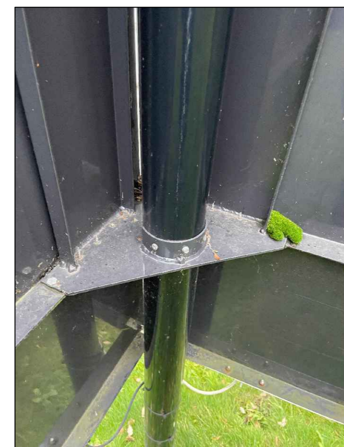
Photo of central column support bracket