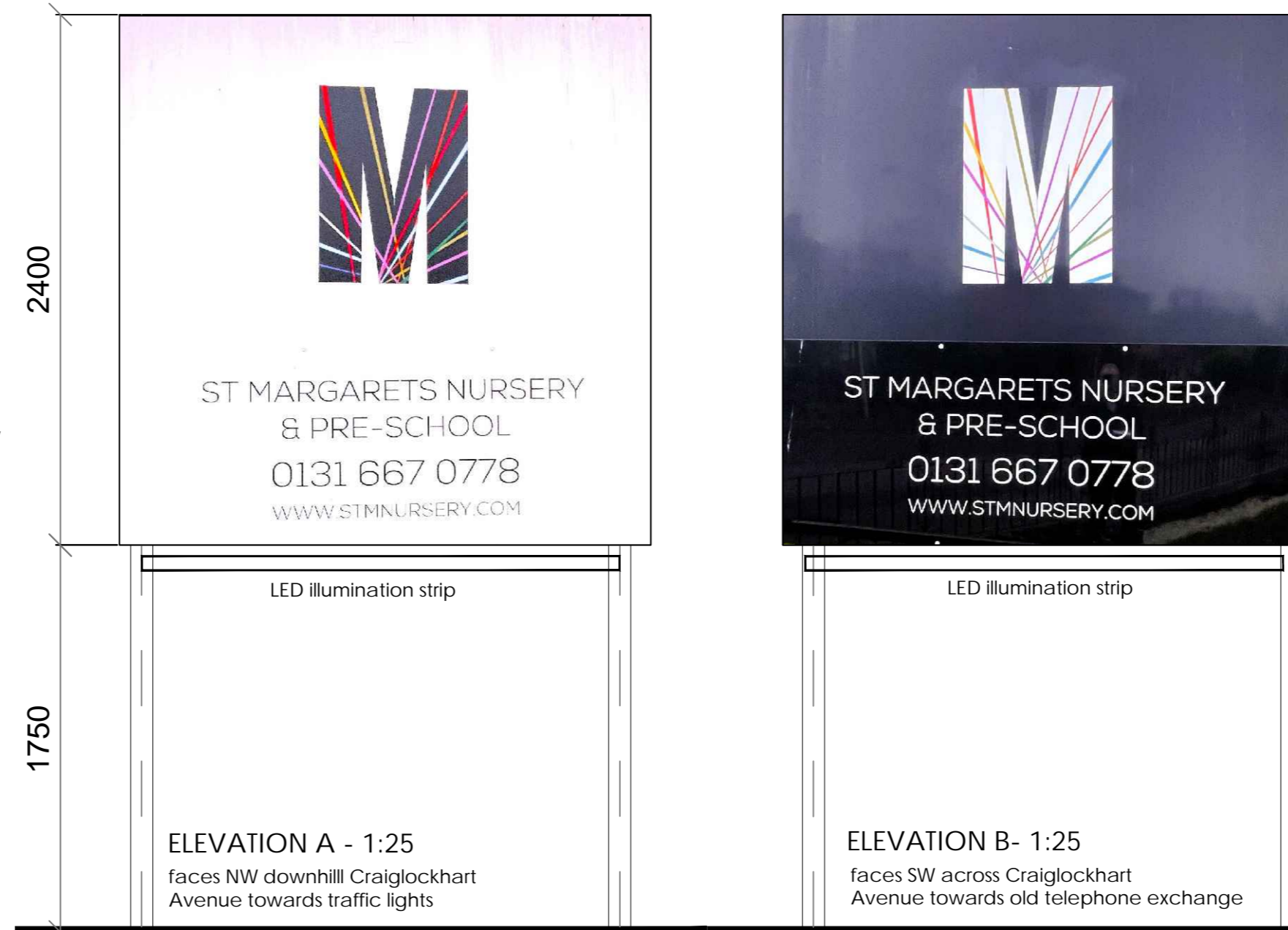
ELEVATION A - 1:25 faces NW downhill Craiglockhart Avenue towards traffic lights

For view of signage in street context - see elevations sheet L(--)-01