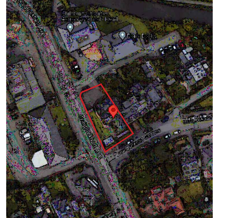
aerial view - n.t.s

Site area = 532.7 sq m Ex. Building footprint area = 160.6 sq m