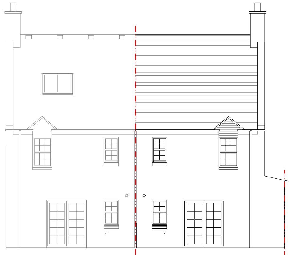
Existing Rear Elevation (E) 1:100