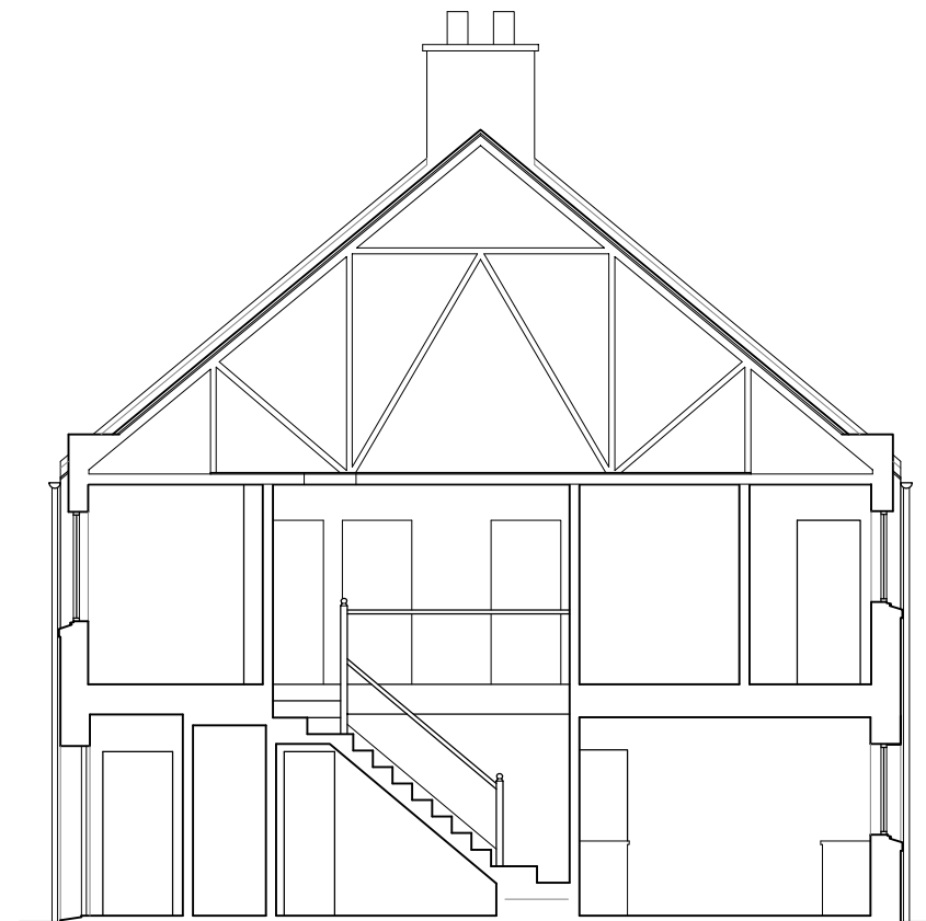
Existing Section A 1:100

Do not scale from drawings. All dimensions to be checked on site before proceeding with works. Boundary lines are indicative. TOLA shall be notified in writing of any discrepancies.