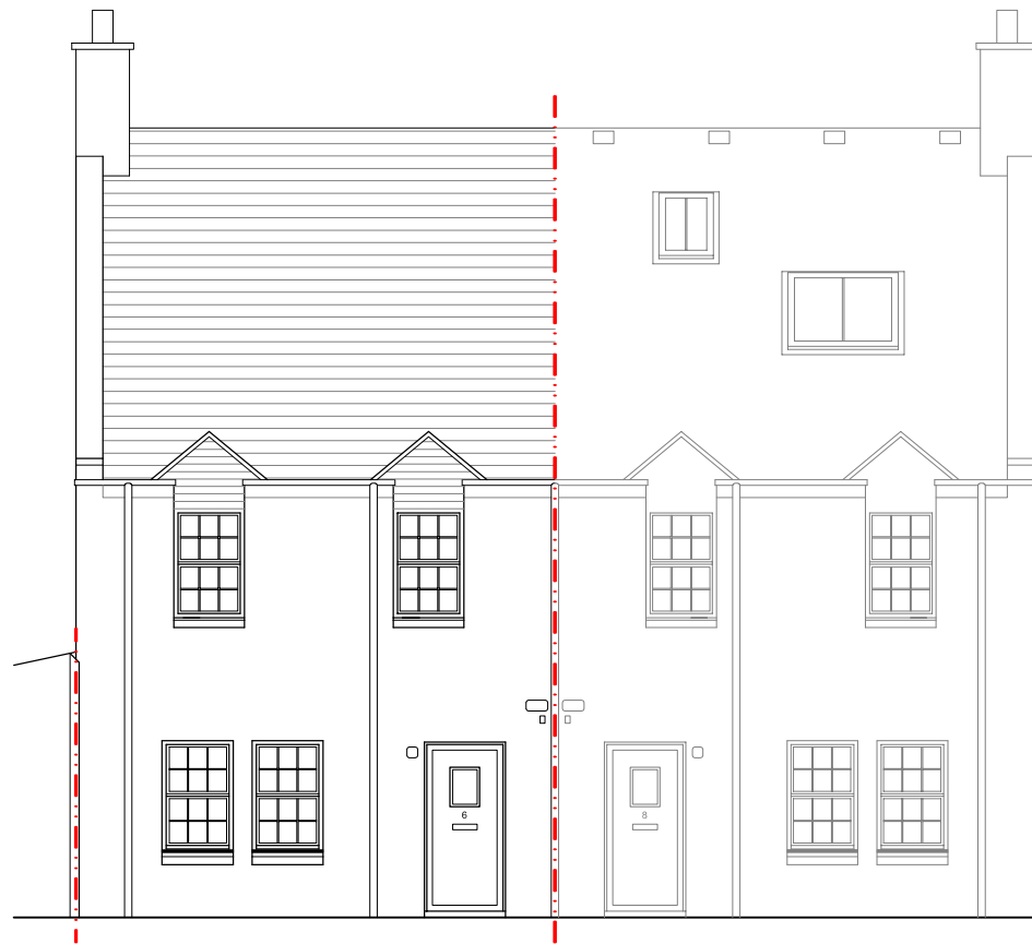
Existing Front Elevation (W) 1:100