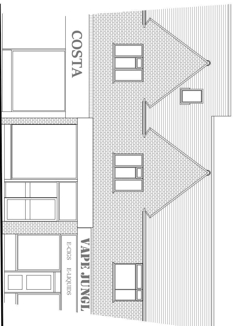
SHOP FRONT ELEVATION