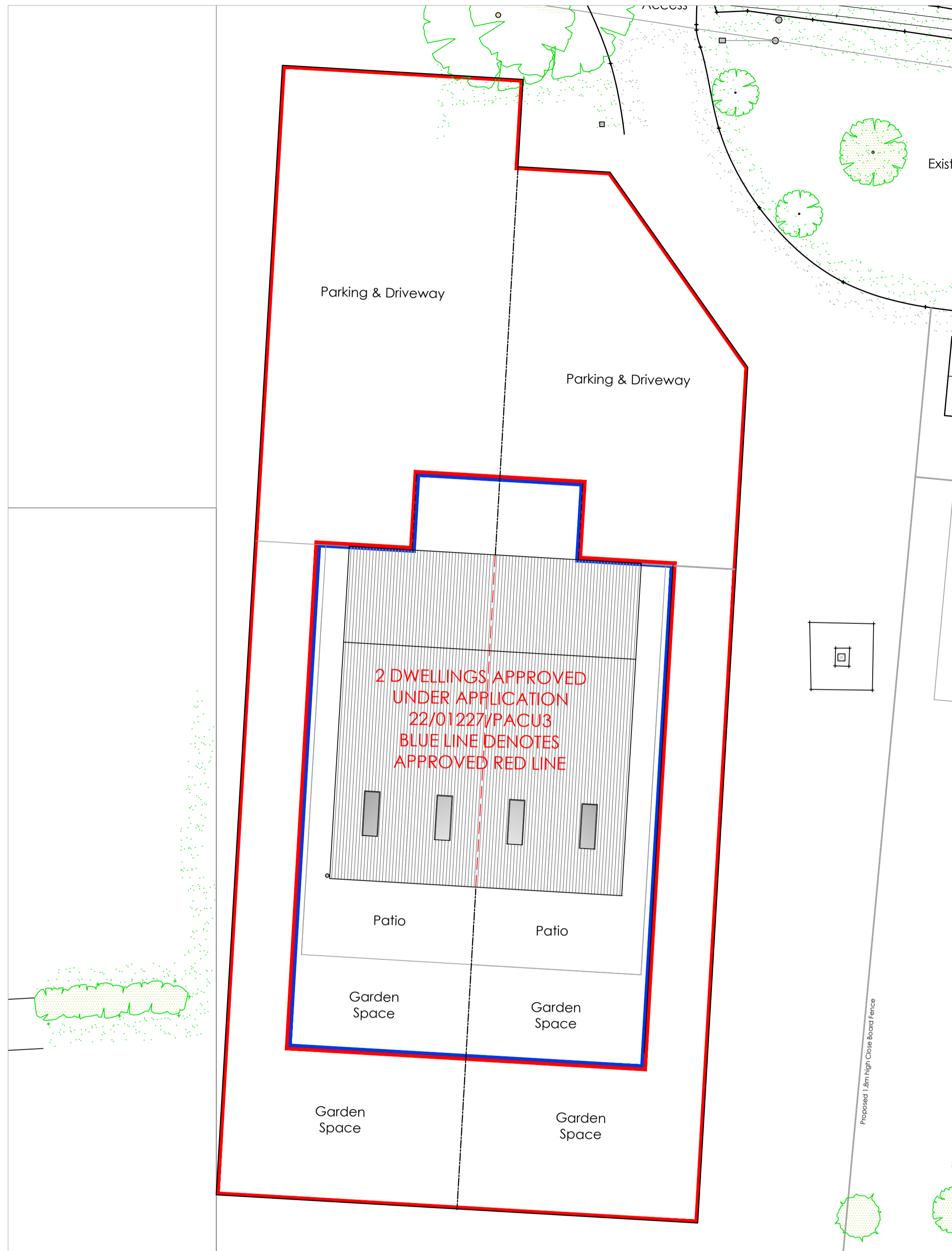
Proposed Site Plan 1:200