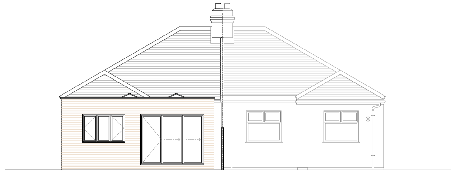
Proposed Rear Elevation 1:100 @ A1