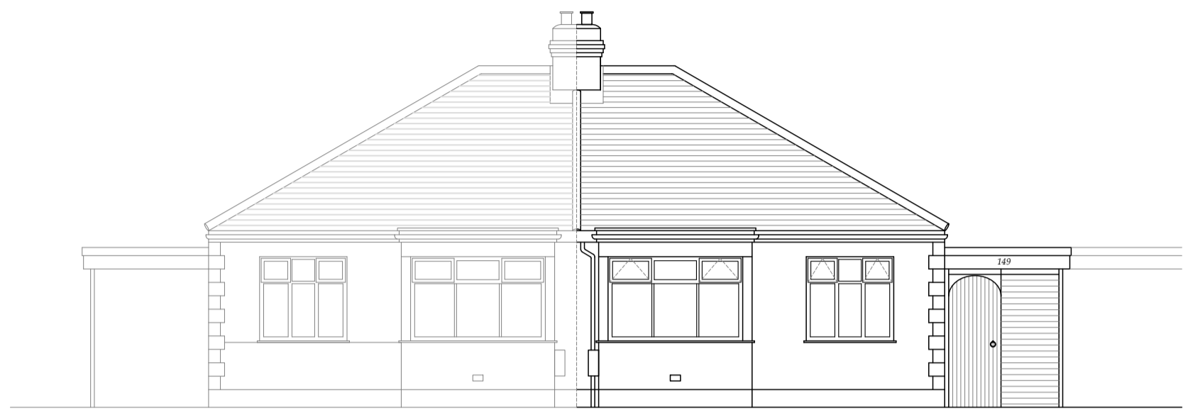
Existing Principle Front Elevation 1:100 @ A1