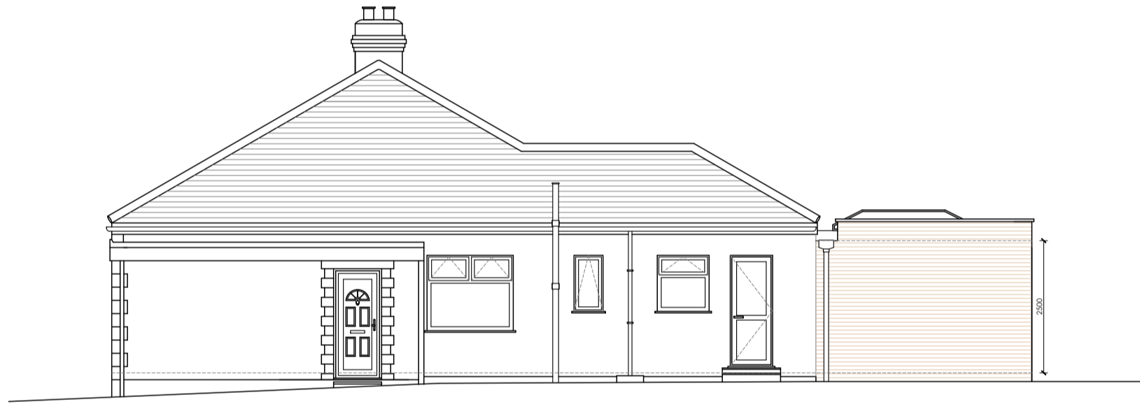
Proposed Side Elevation 1:100 @ A1