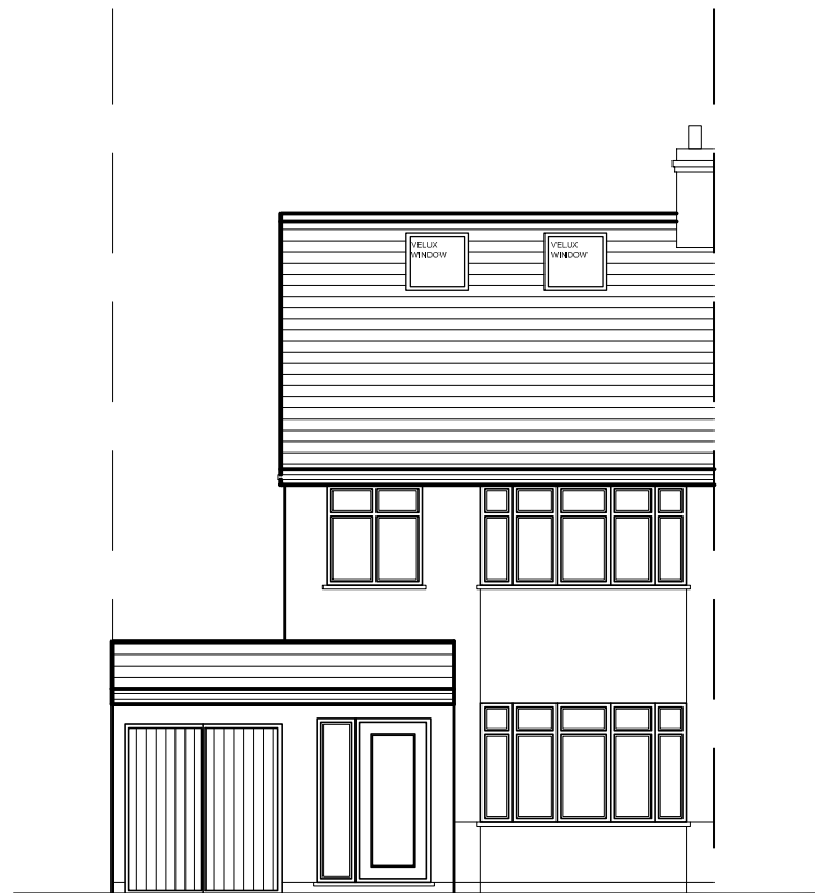
PROPOSED FRONT ELEVATION (NO CHANGE)