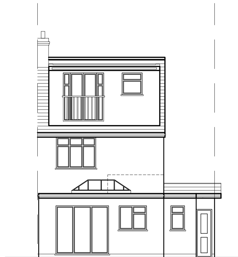
PREVIOUSLY APPROVED REAR ELEVATION