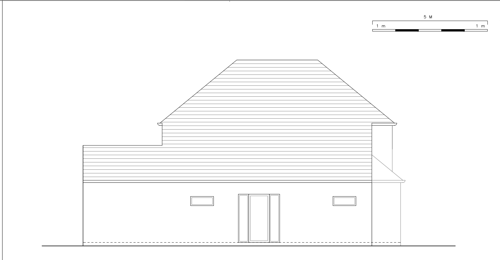
S I D E