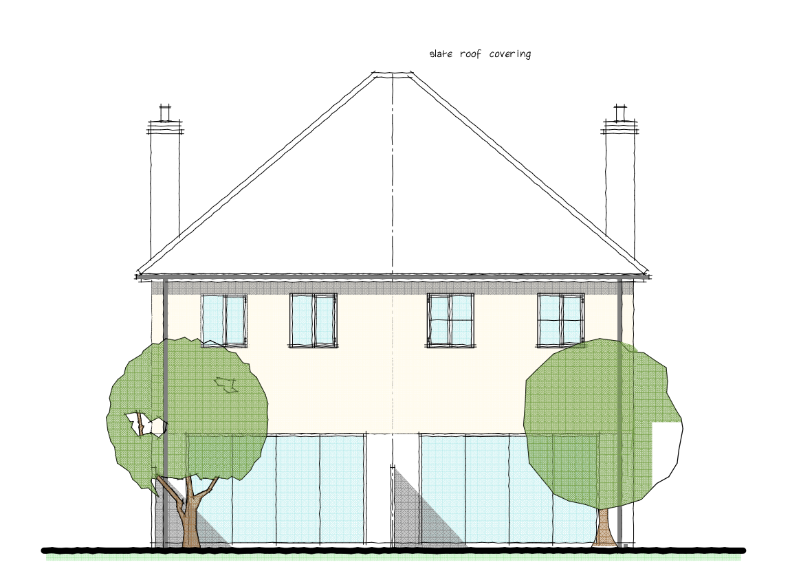
PROPOSED HOUSE TYPE PLOTS 5-6 REAR GARDEN ASPECT