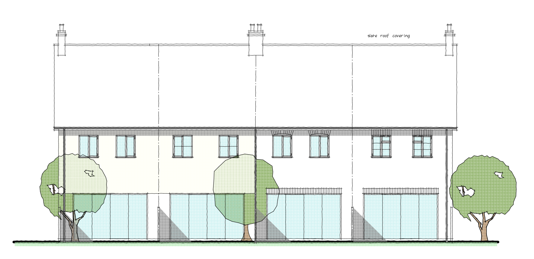
PROPOSED HOUSE TYPE PLOTS 1-4 REAR GARDEN ASPECT