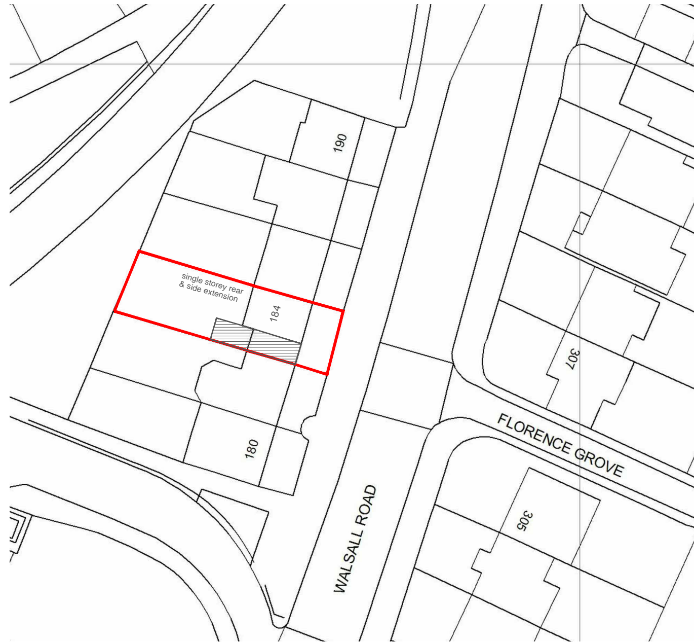
Site Plan 1:500