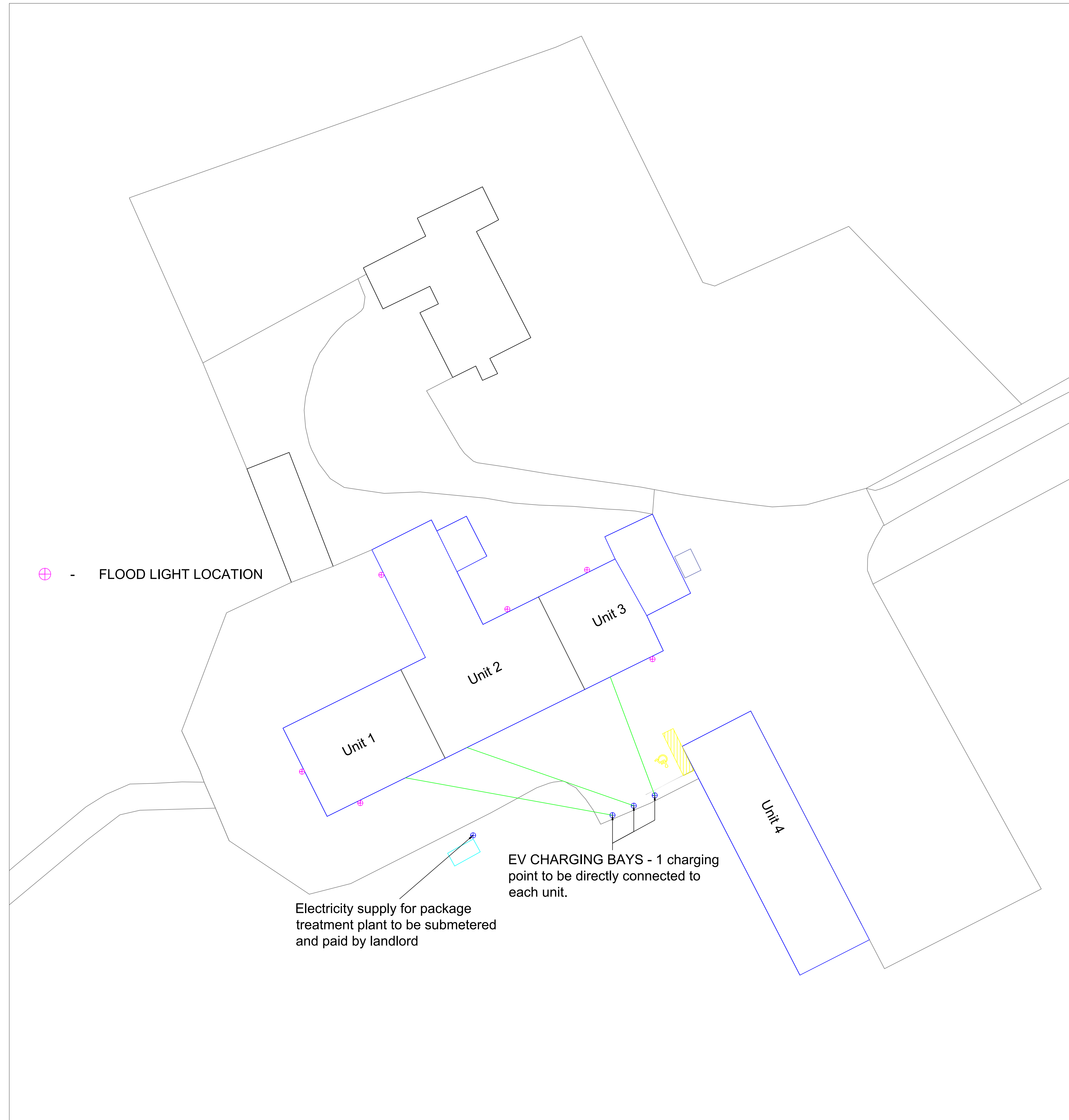
Electrical site plan 1:200