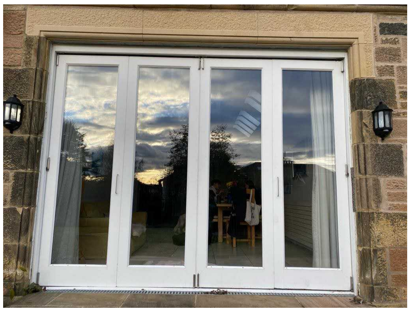
Existing Bi-Fold doors to be replaced with White Timber Sliding Patio Doors supplied by Bereco Windows and Doors 4 panes to match existing. Colour to match the proposed replacement windows.