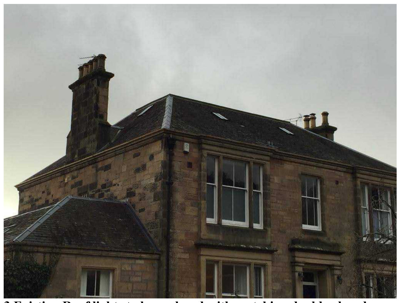
3 Existing Roof lights to be replaced with matching double glazed Conservation Style windows by Velux with recessed fittings.