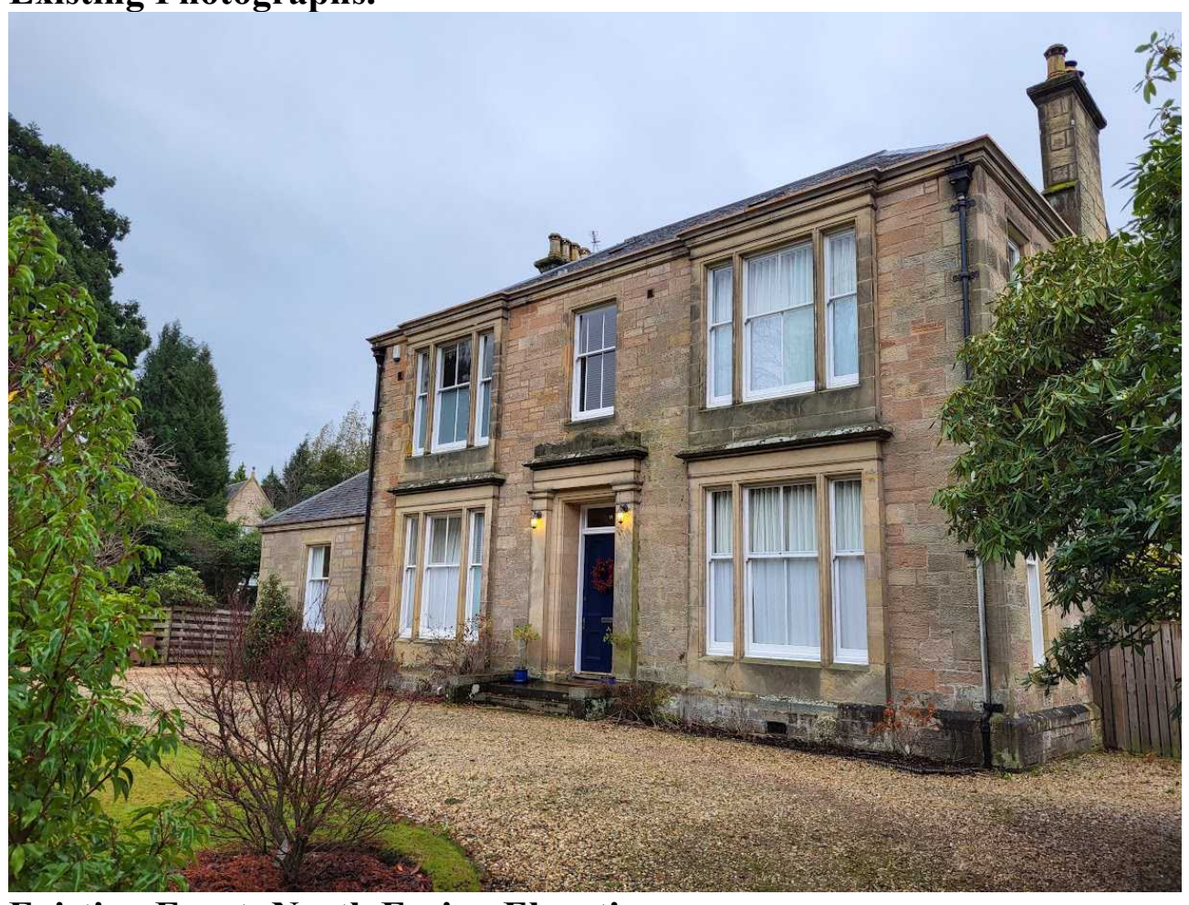
Existing Front -North Facing Elevation All the windows to be replaced