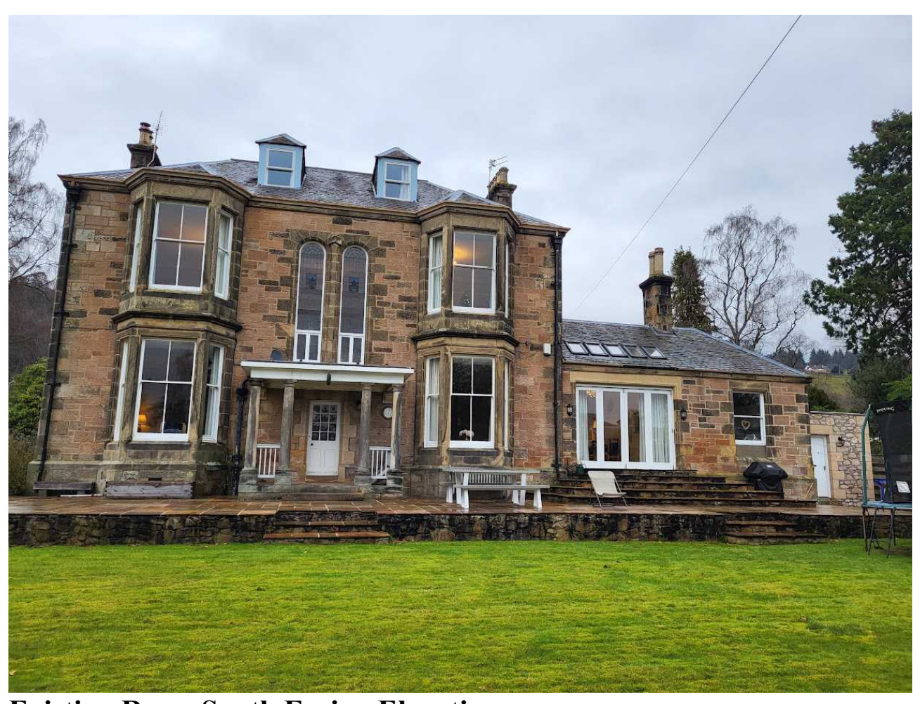
Existing Rear -South Facing Elevation All the windows, door and Bi-fold doors to be replaced except the dormer roof windows and the decorative stair windows.