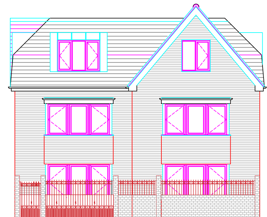
East Elevation - Breck Hill Road