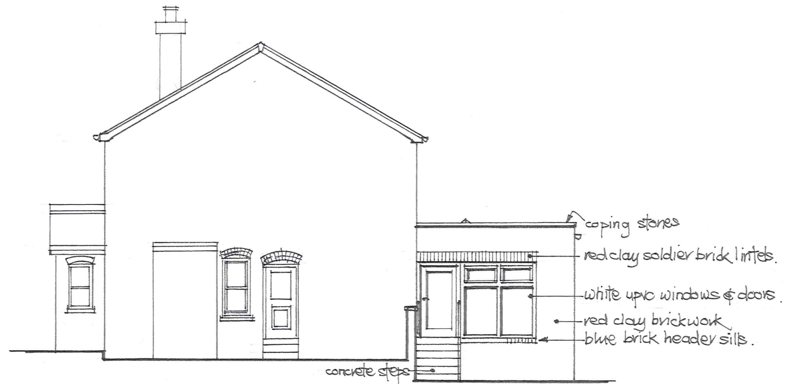
PROPOSED EAST ELEVATION 1:100